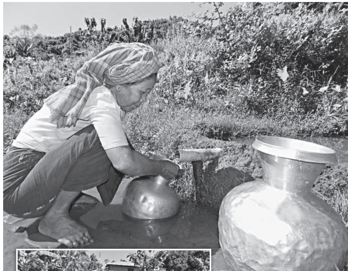
A woman collects water from a jhiri (small water flow in hills) at Godar Para in Bandarban municipality as there is no other source of drinking water in the vicinity. Inset, a broken road in the area.

"The picturesque tourist spots of the district attract thousands of visitors from home and abroad round the year but lack of facilities including potable water hampers tourism here," said Sirajul Islam, secretary of hotel owners' association in Bandarban.