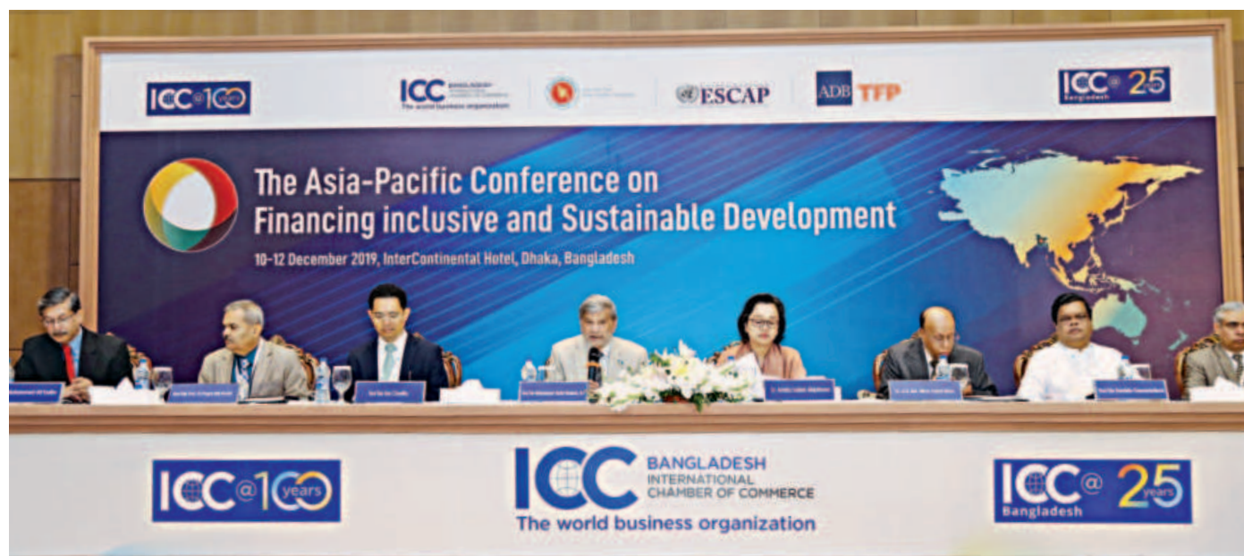
Planning Minister MA Mannan speaks at a session of the "Asia-Pacific Conference on Financing for Inclusive and Sustainable Development" organised by the International Chamber of Commerce Bangladesh at the InterContinental Dhaka hotel yesterday.