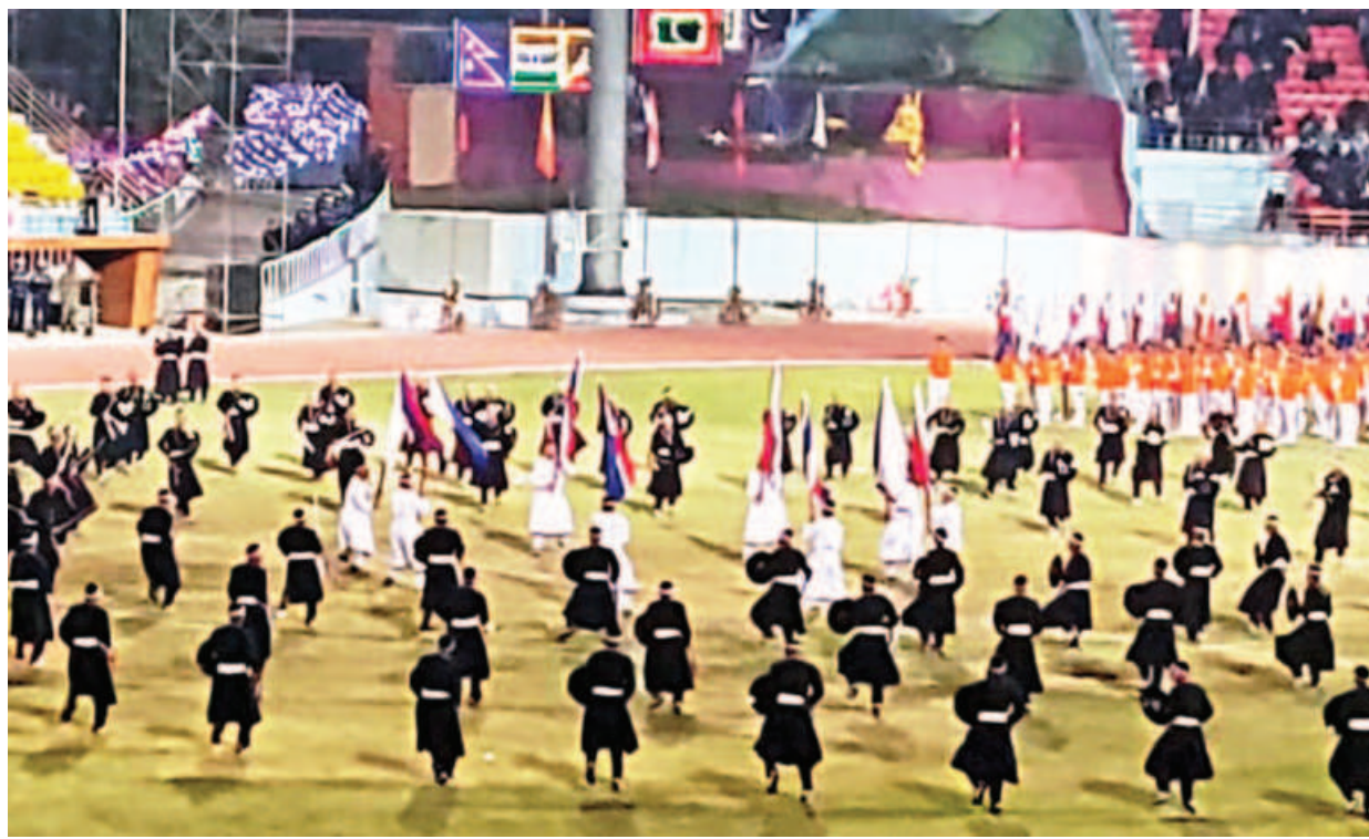
(Clockwise from Bottom) The curtains fell on the 13th South Asian Games through a festive closing ceremony at the Dasarath Rangasala Stadium in Kathmandu, Nepal yesterday. Throughout the ten-day competition, Bangladesh's archers brought many a laurel to the country. However, the same could not be said for the football team.

of gold medals in the early years of this regional meet. However, swimmers failed to win a single gold medal for the country.