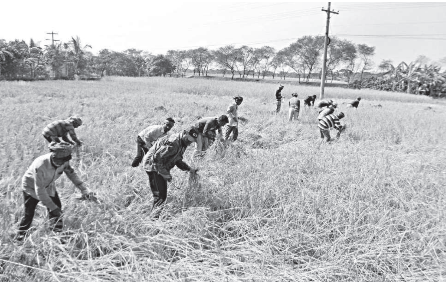
Farmers reap Aman paddy at a field of Nilganj village in Patuakhali's Kalapara upazila.