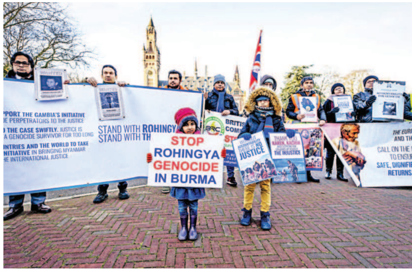
Protesters take part in a demonstration in support to the Rohingya Muslim minority in front of the Peace Palace in The Hague, yesterday, during the start of a three-day hearing on Rohingya genocide case at the UN's International Court of Justice.

The names of those aboard the missing airplane were released. Most were air force personnel, but also included three people from the army, two from a private construction company and an official from a Chilean university.