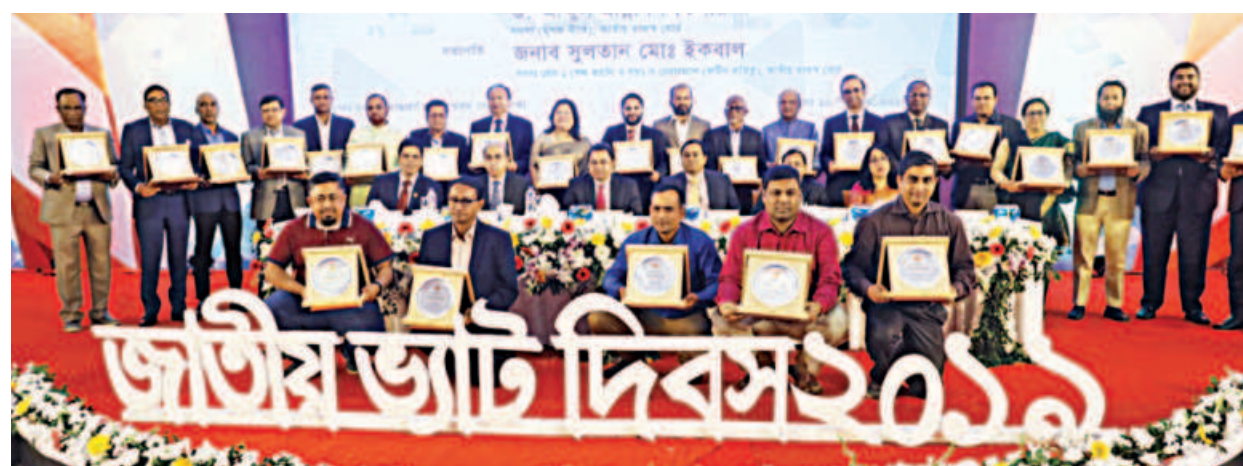
Finance Minister AHM Mustafa Kamal poses with the officials of top VAT-paying firms in manufacturing, trade and services sectors in 2017-18 at Bangabandhu International Conference Centre in Dhaka yesterday.