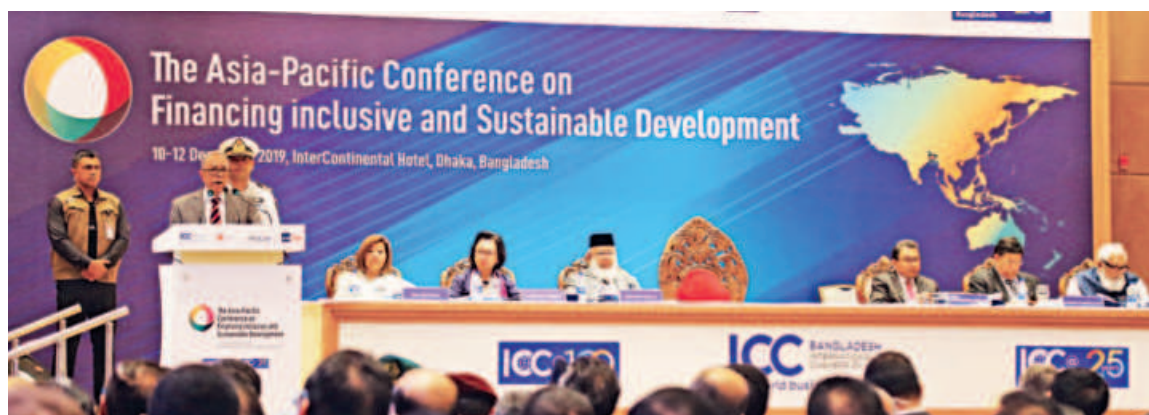
President Md Abdul Hamid speaks while inaugurating the "Asia-Pacific Conference on Financing for Inclusive and Sustainable Development" organised by the International Chamber of Commerce Bangladesh at the InterContinental Dhaka hotel yesterday.

"We are one of the most open economies among the developing countries and wish to continue the process," Hamid said.