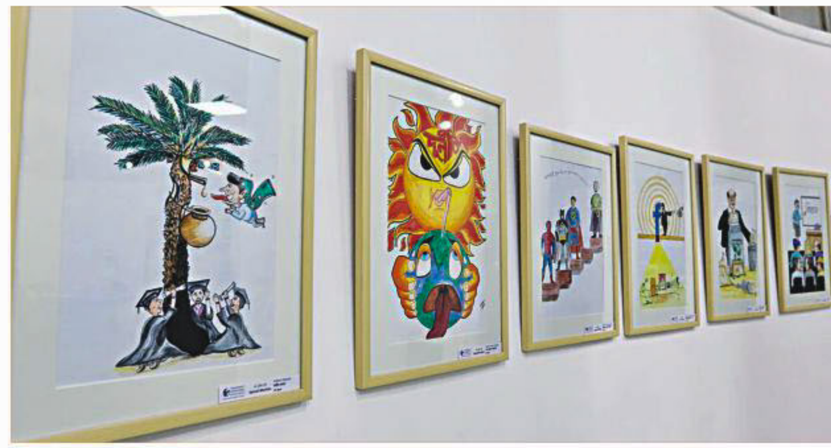
Artworks on exhibit at the event.