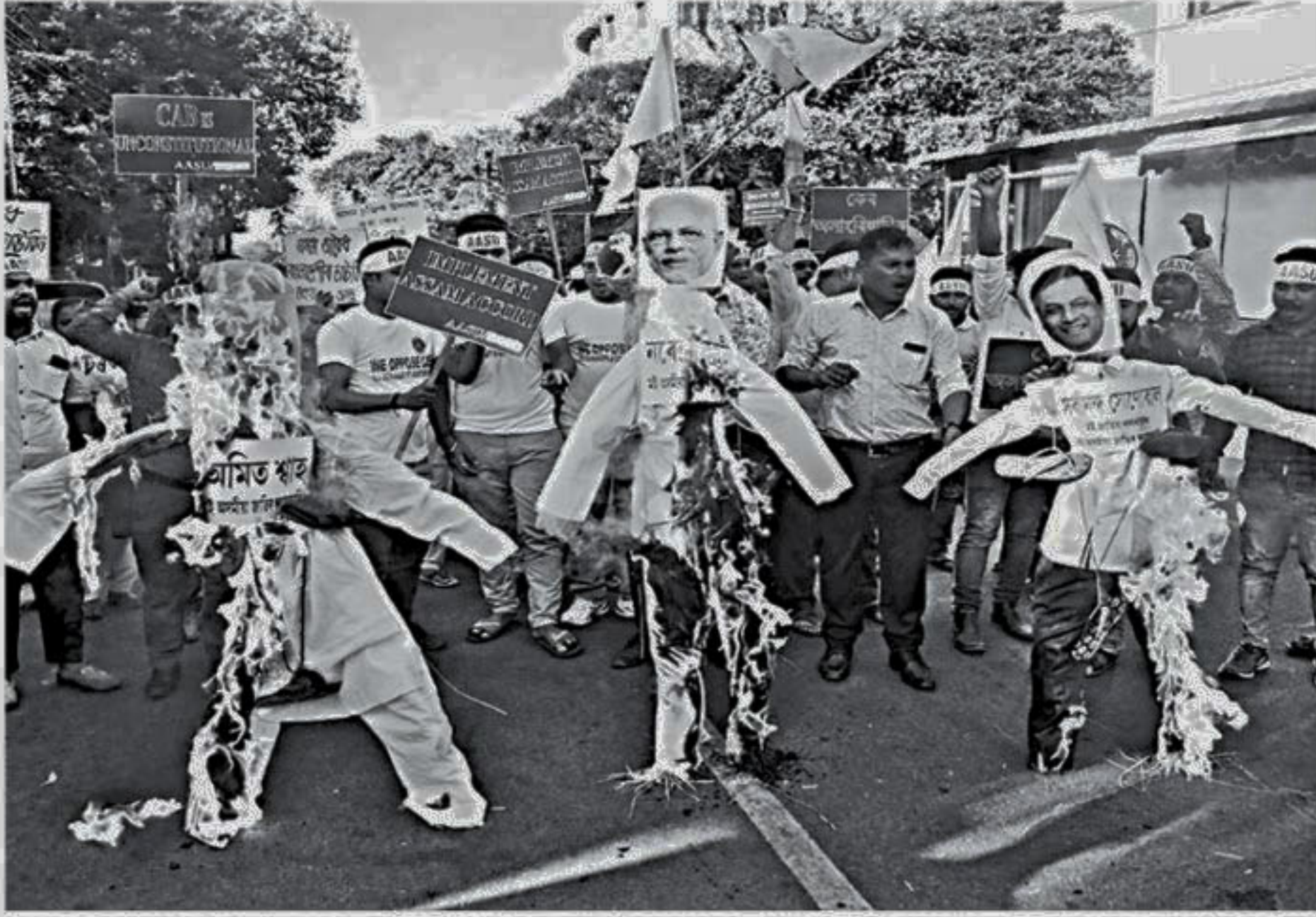
Activists from the All Assam Students Union (AASU) burn effigies depicting India's Home Minister Amit Shah, Prime Minister Narendra Modi and Chief Minister of Assam Sarbananda Sonowal during a protest against the Citizenship Amendment Bill, in Guwahati, India, on December 4, 2019.