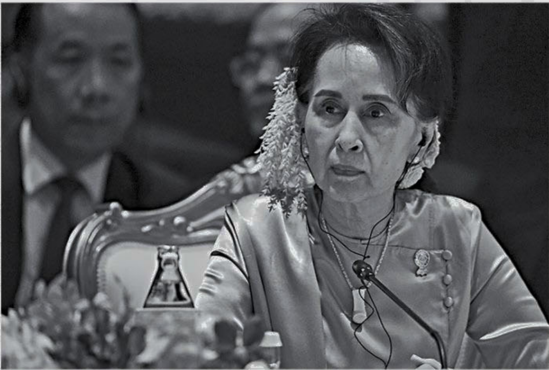
State Counsellor of Myanmar Aung San Suu Kyi

The second lawsuit was filed by Rohingya and Latin American human rights groups in Argentina on November 13, 2019 under the principle of "universal jurisdiction", a legal concept enshrined in many countries'