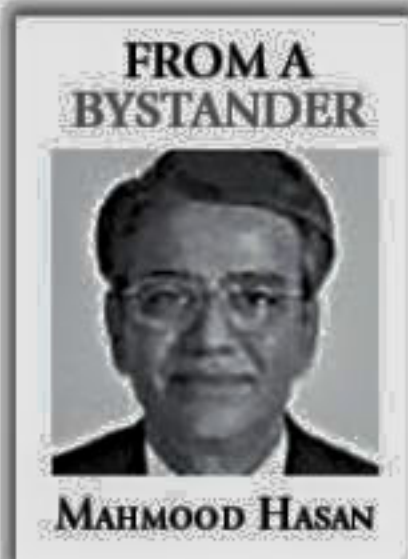
FROM A BYSTANDER MAHMOOD HASAN

THE Myanmar military and the civilian government of Aung San Suu Kyi are literally between a rock and a hard place. Two cases of violation of the Genocide Convention filed against Myanmar have shaken its leaders.