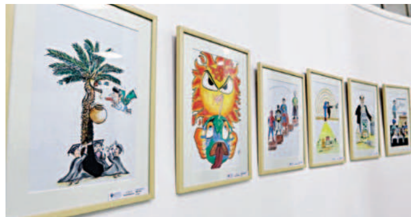
Artworks on exhibit at the event.