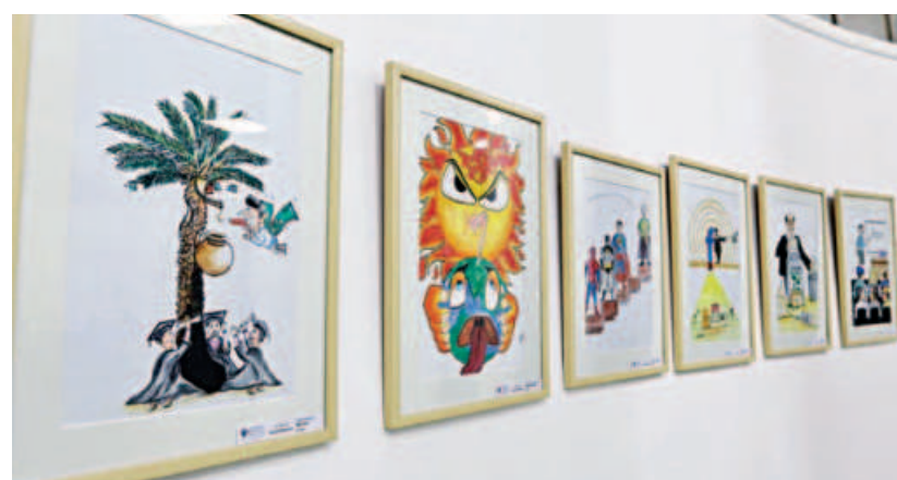
Artworks on exhibit at the event.