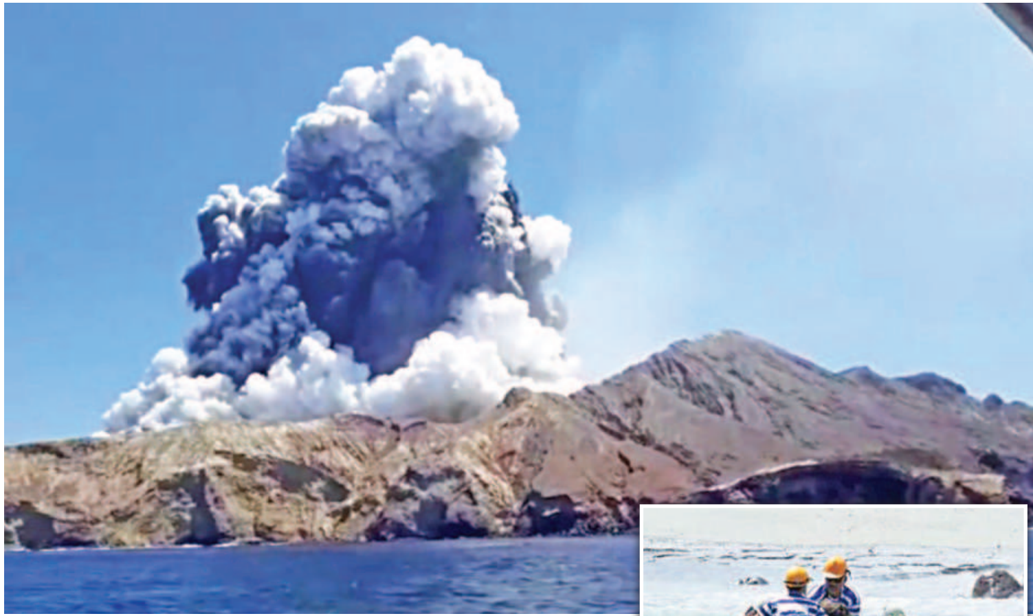
Smoke from the volcanic eruption of Whakaari, also known as White Island, is pictured from a boat in New Zealand yesterday. Inset, White Island Tour operators rescuing people minutes after the volcano erupted. Five people were killed, 18 were injured and several more were left stranded after the island volcano popular with tourists erupted unexpectedly.

France's transport chaos deepened yesterday on the fifth day of a nationwide strike over pension reforms, ramping up tensions at the start of a crucial week in President Emmanuel Macron's battle with trade unions. With only two of the Paris metro's 16 lines running as normal and suburban trains also heavily disrupted, many commuters slipped behind the wheel to try to get to work in torrential rain, causing major gridlock.