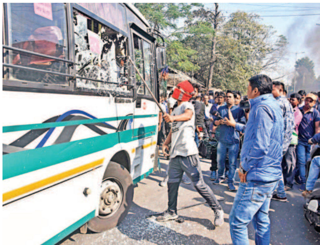
A protester breaks a glass window of a city bus during a strike called by All Assam Chutia Students' Union (AACSU) in protest against the government's Citizenship Amendment Bill, in Guwahati yesterday.

Nadler was set to convene his committee at 9:00 am yesterday, to hear evidence from both Democratic and Republican lawyers from the judiciary committee.