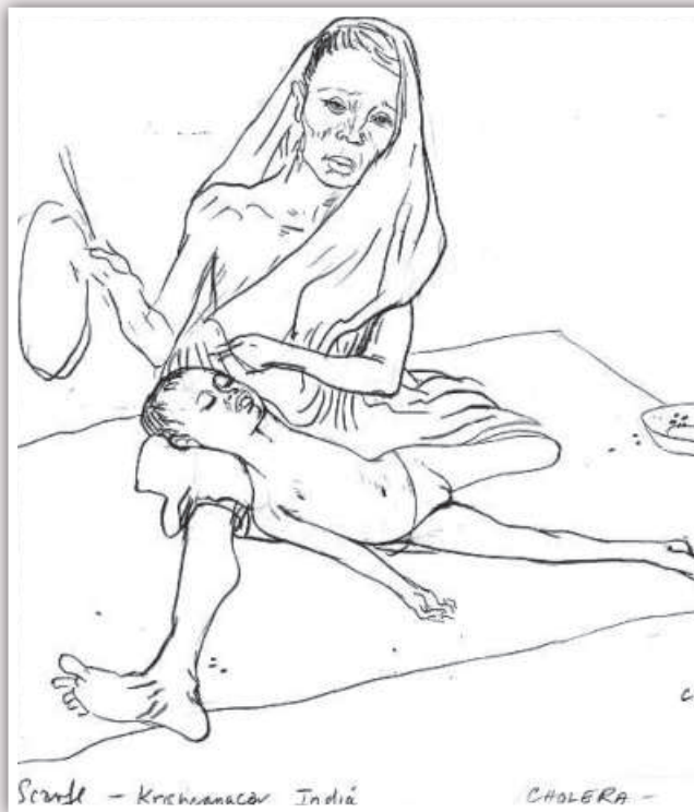
Scarfe - Krishnanagar India