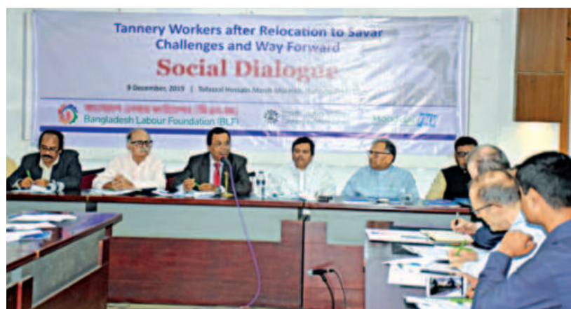
Experts attend a seminar on tannery workers and challenges of the sector at the National Press Club in Dhaka yesterday.

In the first five months of the current fiscal year, receipts from