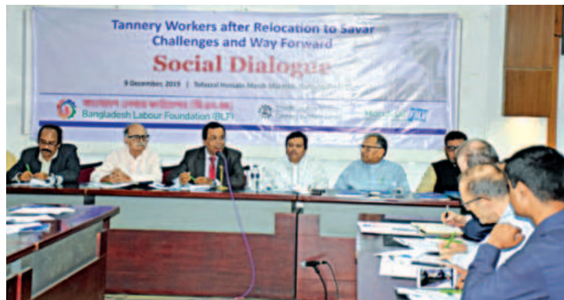
Experts attend a seminar on tannery workers and challenges of the sector at the National Press Club in Dhaka yesterday.

In the first five months of the current fiscal year, receipts from