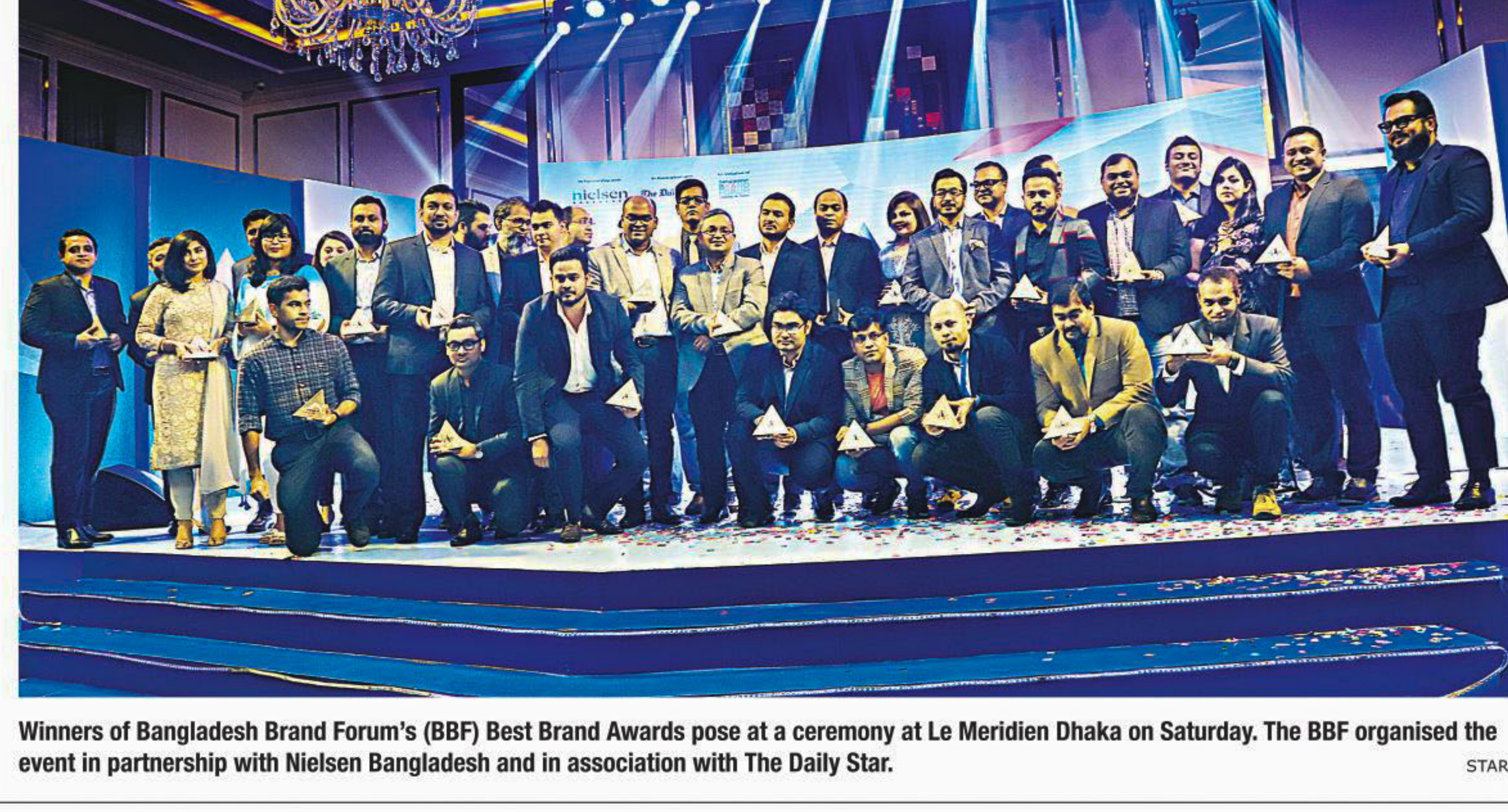
Winners of Bangladesh Brand Forum's (BBF) Best Brand Awards pose at a ceremony at Le Meridien Dhaka on Saturday. The BBF organised the event in partnership with Nielsen Bangladesh and in association with The Daily Star.