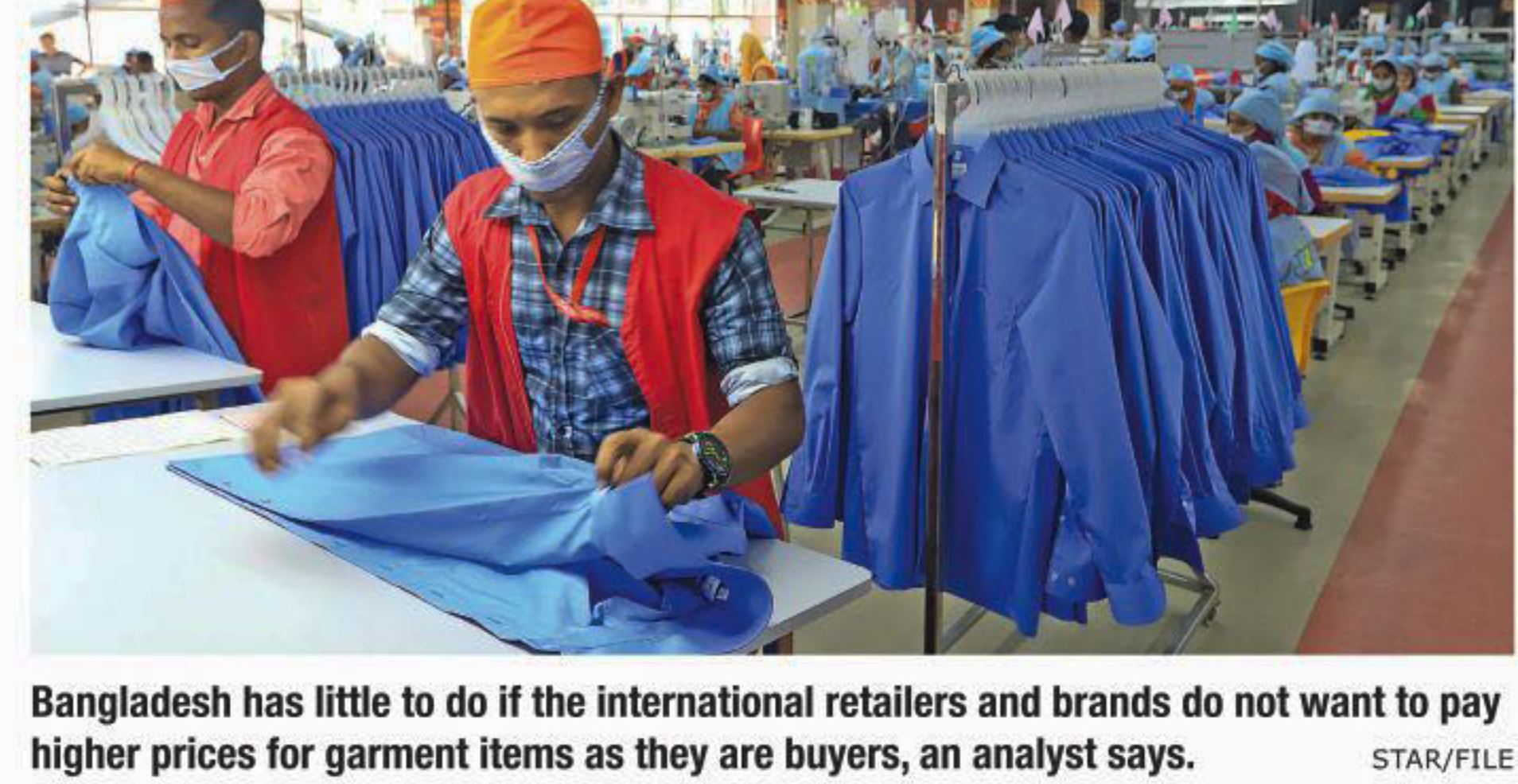
Bangladesh has little to do if the international retailers and brands do not want to pay higher prices for garment items as they are buyers, an analyst says.

REFAYET ULLAH MIRDHA The prices of Bangladeshi made apparel items continued to fall since the Rana Plaza building collapse in April 2013 although the prices of cotton, the main raw material for fabrics, increased during the time to some extent.