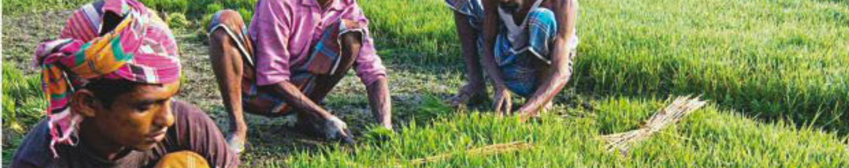
Banks usually disburse a major portion of their annual farm loans during September-December when farmers spend busy time harvesting boro paddy and winter vegetables.

Agriculture lending rose 13.13 percent year-on-year to Tk 6,055 crore between July and October, according to data from the central bank.