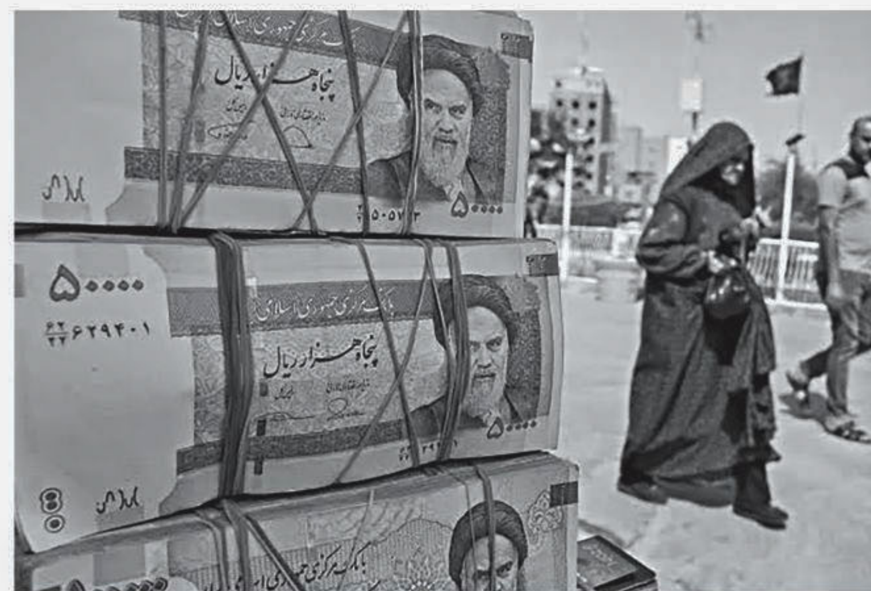
Iranian rial currency notes are seen at a market in the holy Shi'ite city of Najaf, Iraq September 22, 2019.

These developments suggest that restrictions on oil exports may be forcing Iran to diversify its economy, a sort of Dutch disease in reverse. The country's hardliners argue that US sanctions are galvanising the "resistance economy," which is less reliant on trade in general, and especially on trade with the West