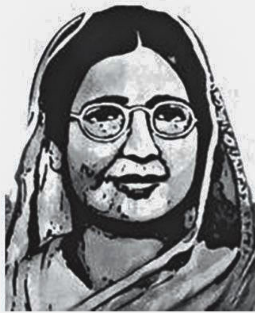
Begum Rokeya (December 9, 1880 - December 9, 1932)

have undergone significant changes and major milestones have been achieved, especially in imparting basic education to girls. Women's long struggle have paved the way for many women taking up important roles in society. Two women leaders have been dominating our politics for the last two decades. More women than ever before are enrolled in schools, colleges and universities. Yet, the lives of working women have not improved meaningfully. Much remains to be done.