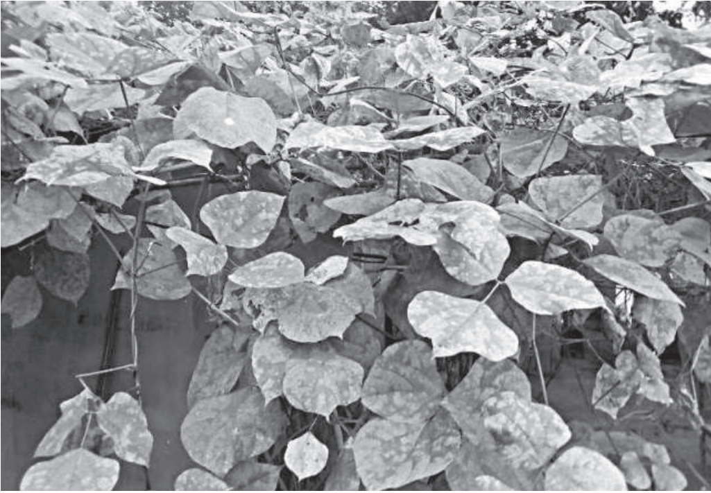
Bean leaves have turned yellowish due to attack of virus at a field in Moulvibazar's Juri upazila.

Some farmers blamed the weather change for the severity of the virus attack while experts said farmers' excessive use of pesticides might have caused insects to grow resistance to the chemicals.