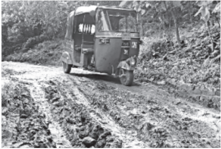
A CNG-run auto-rickshaw plies the damaged road amid risk of accident in Rangamati's Rawzan upazila.

High School, said every day he uses the road to go to school.