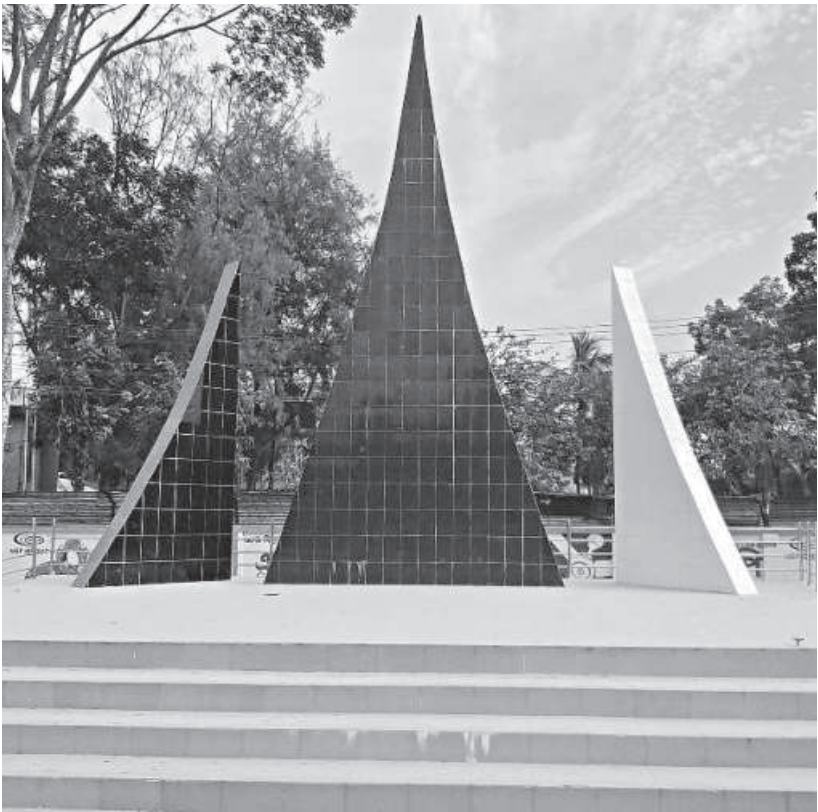
Liberation War memorial in Patuakhali town.