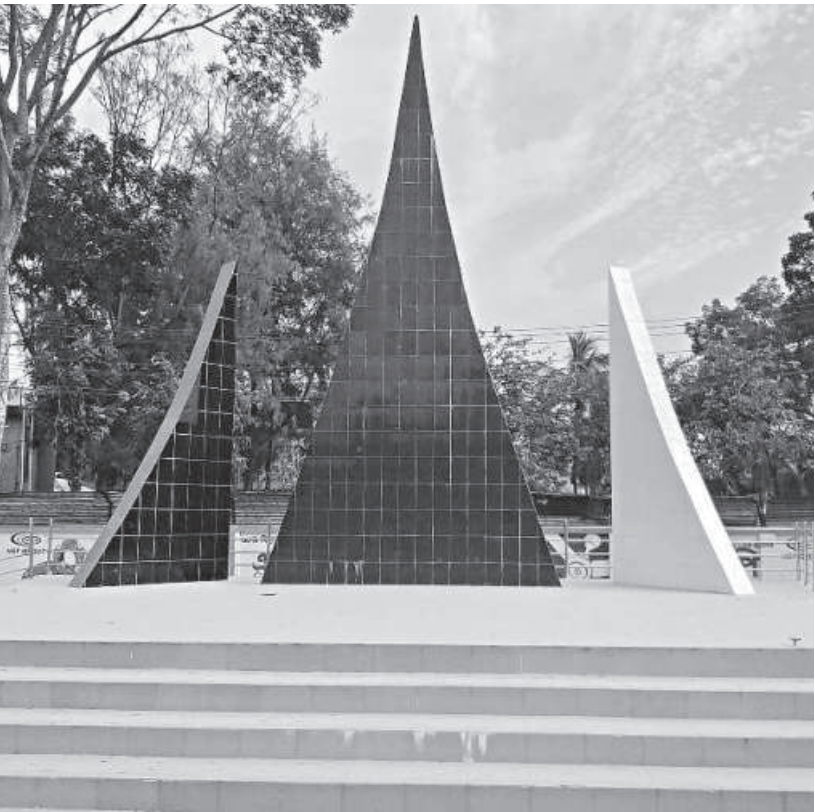
Liberation War memorial in Patuakhali town.