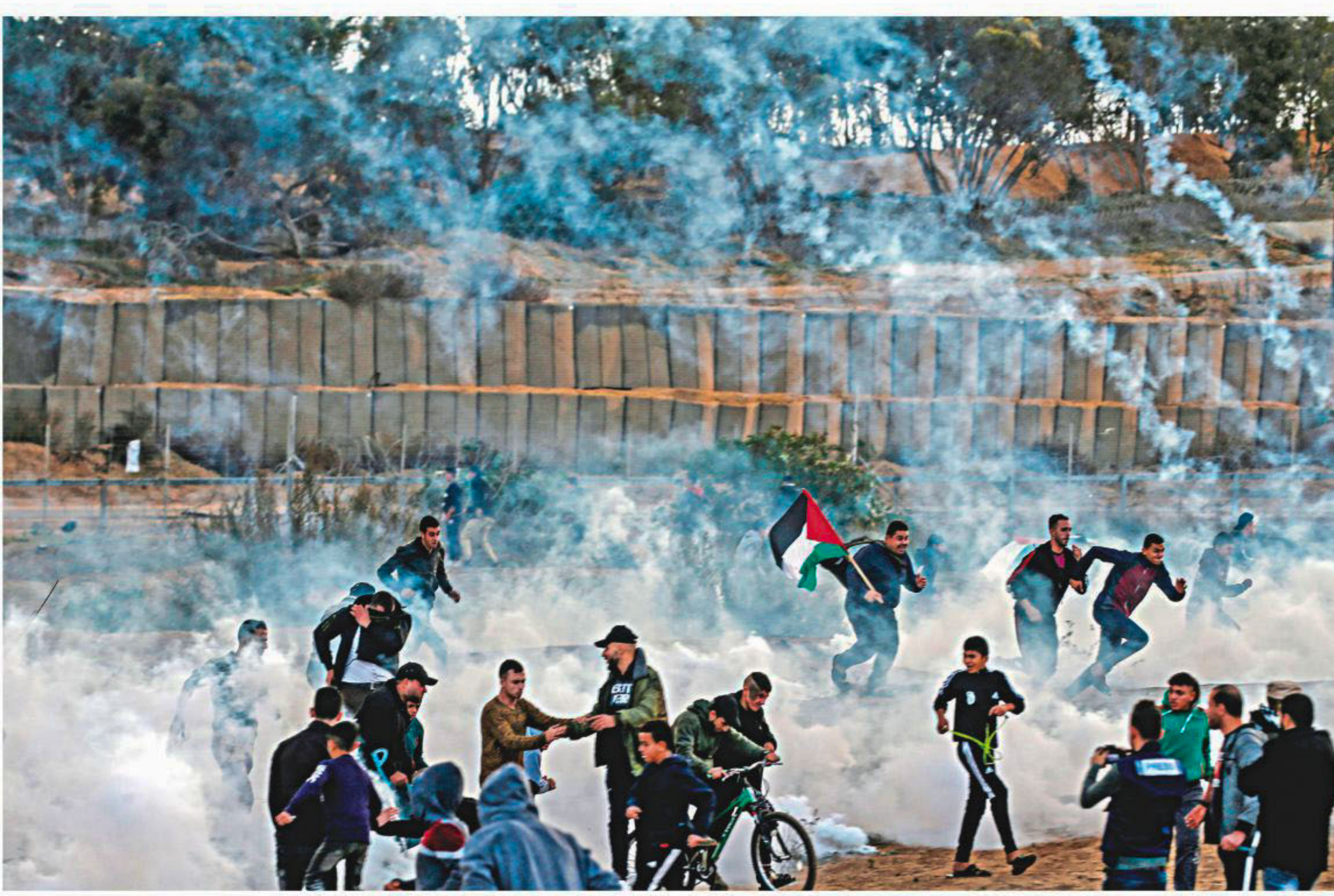
Palestinian protesters run from tear gas fired by Israeli forces during a demonstration along the border with Israel east of Bureij in the central Gaza Strip, yesterday.

AFP, Hong Kong Hong Kong pro-democracy activists yesterday vowed to hold another massive rally over the weekend and warned the city's pro-Beijing leader not to think a recent lull in violence means public anger is weakening. The semi-autonomous financial hub has been battered by six months of increasingly violent protests pushing for greater democratic freedoms and police accountability in the most stark challenge the city has presented to Beijing since its 1997 handover.