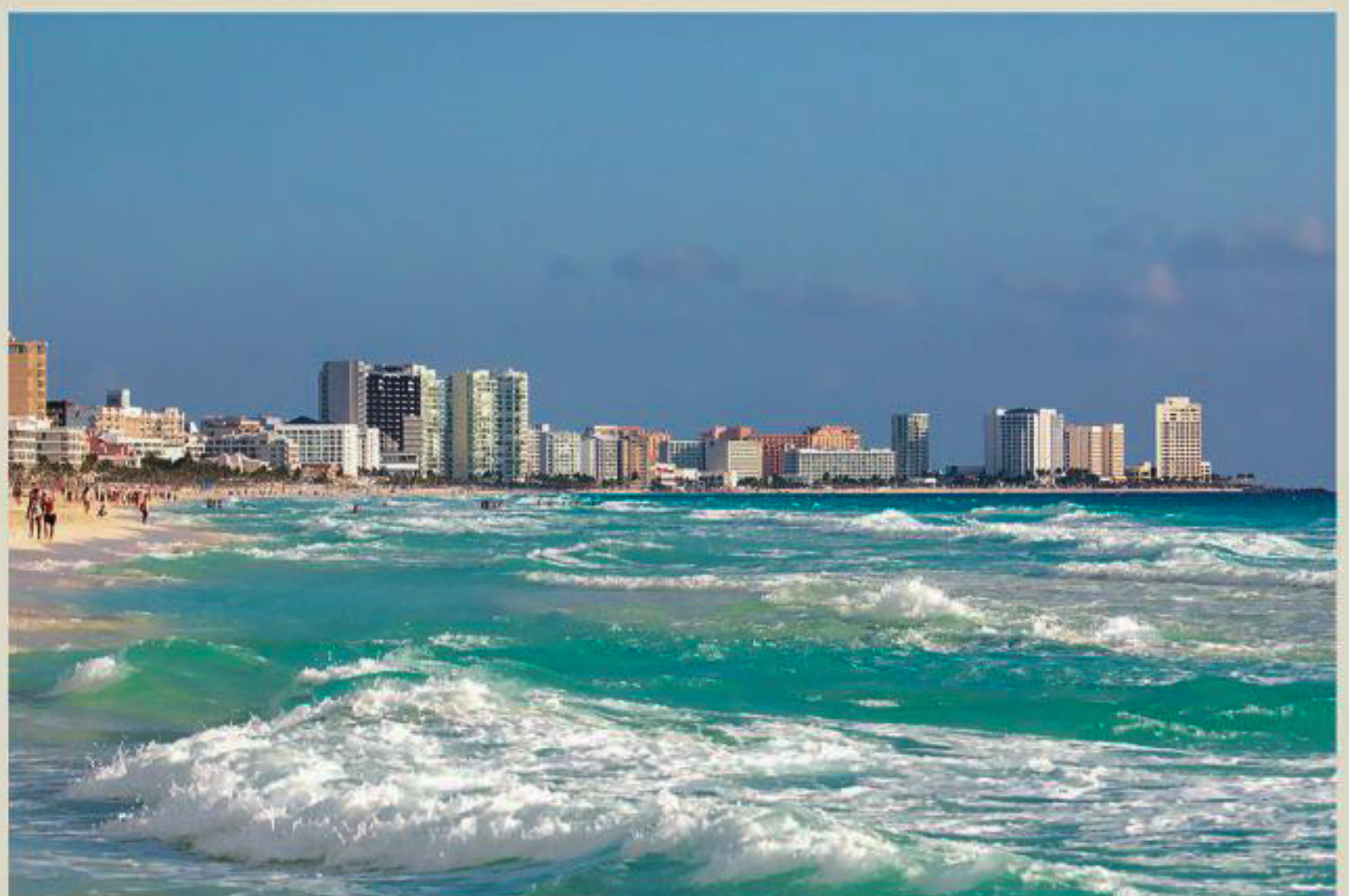
Beach front today, Cancun.