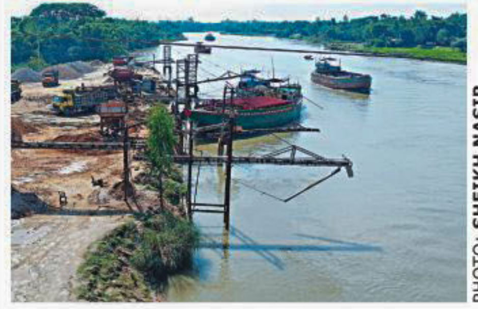
A stone crusher beside Kataganj river.

Stone or rock crushers are machines that are used to break down large stones into smaller pieces to be used for construction work. These machines are being operated in Sylhet Sadar, Dakshin Surma,