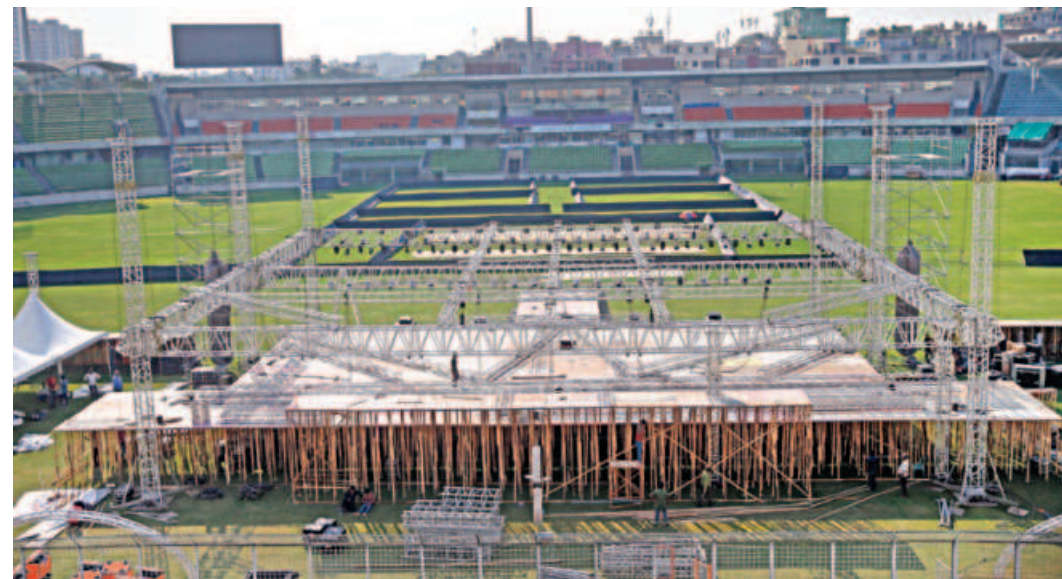
Preparations for a grand BBPL opening ceremony tomorrow are well underway at the Sher-e-Bangla National Stadium in Mirpur. This picture taken yesterday shows nearly all of the eastern half of the ground taken up by a sprawling stage, in front of which will be situated special on-ground seats.