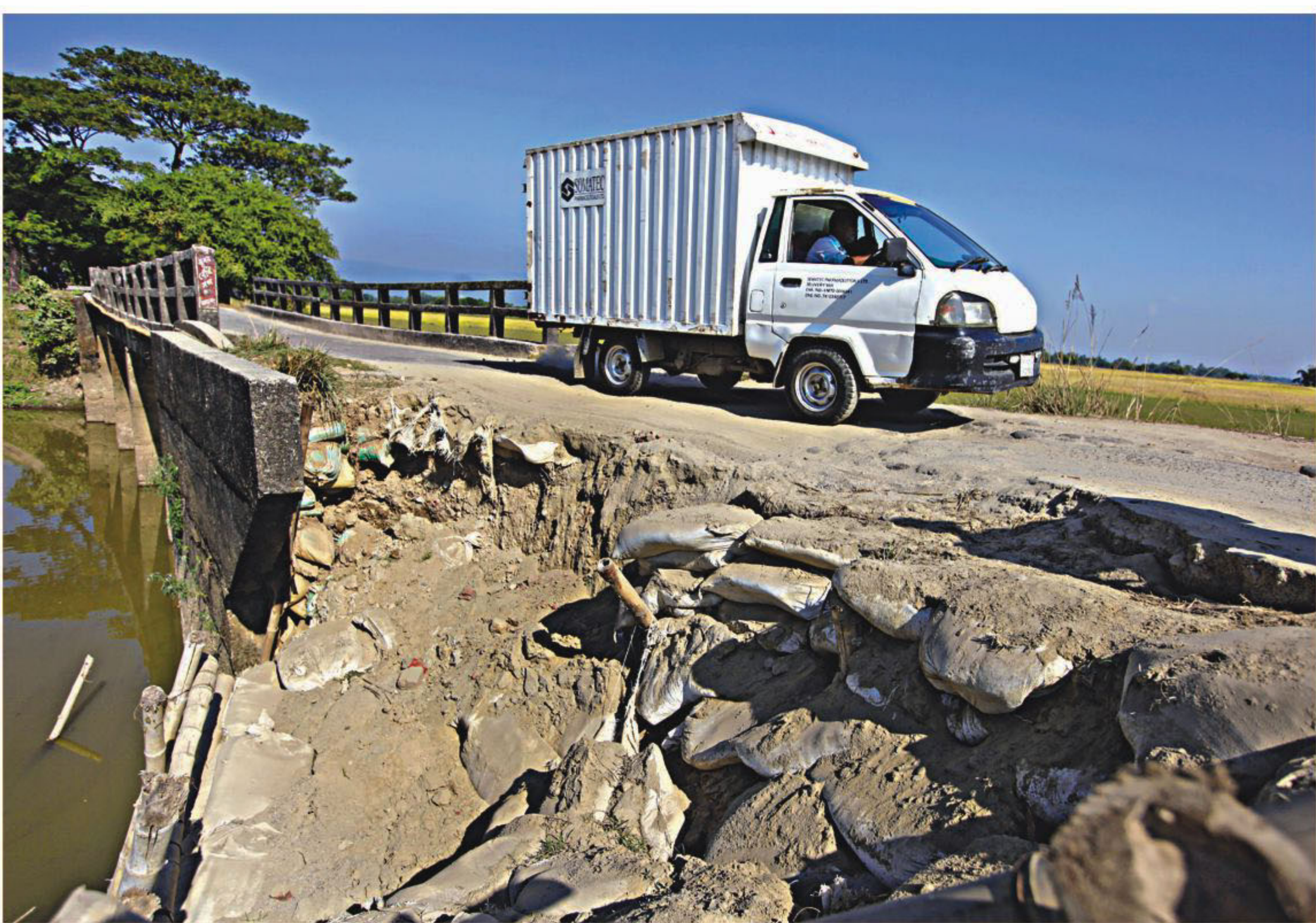
A van crosses a badly damaged bridge in Paschim Jaflong Chotkhal area in Sylhet's Gowainghat upazila yesterday. Locals said part of the bridge's approach road caved in six months ago, after which the LGRD did some makeshift repairs using sandbags and bamboos. Those too were flooded away by recent rains.