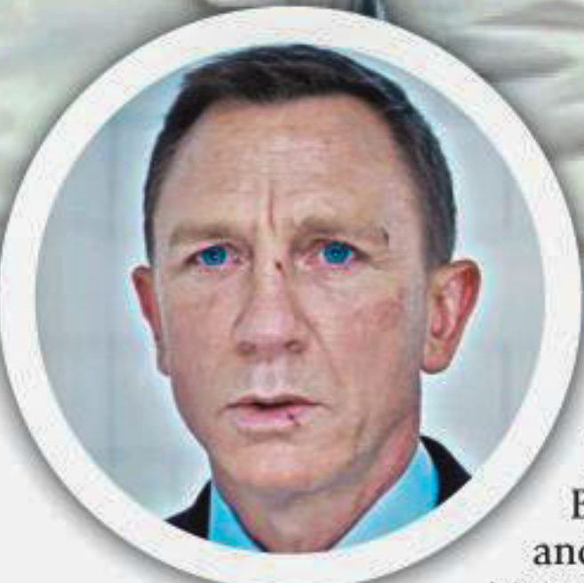
David Dencik, Dali Benssalah and Billy Magnussen.

Alongside Craig and Malek, the film also stars Ralph Fiennes, Naomie Harris, Ben Whishaw, Rory Kinnear, Jeffrey Wright, Ana de Armas, Lashana Lynch,