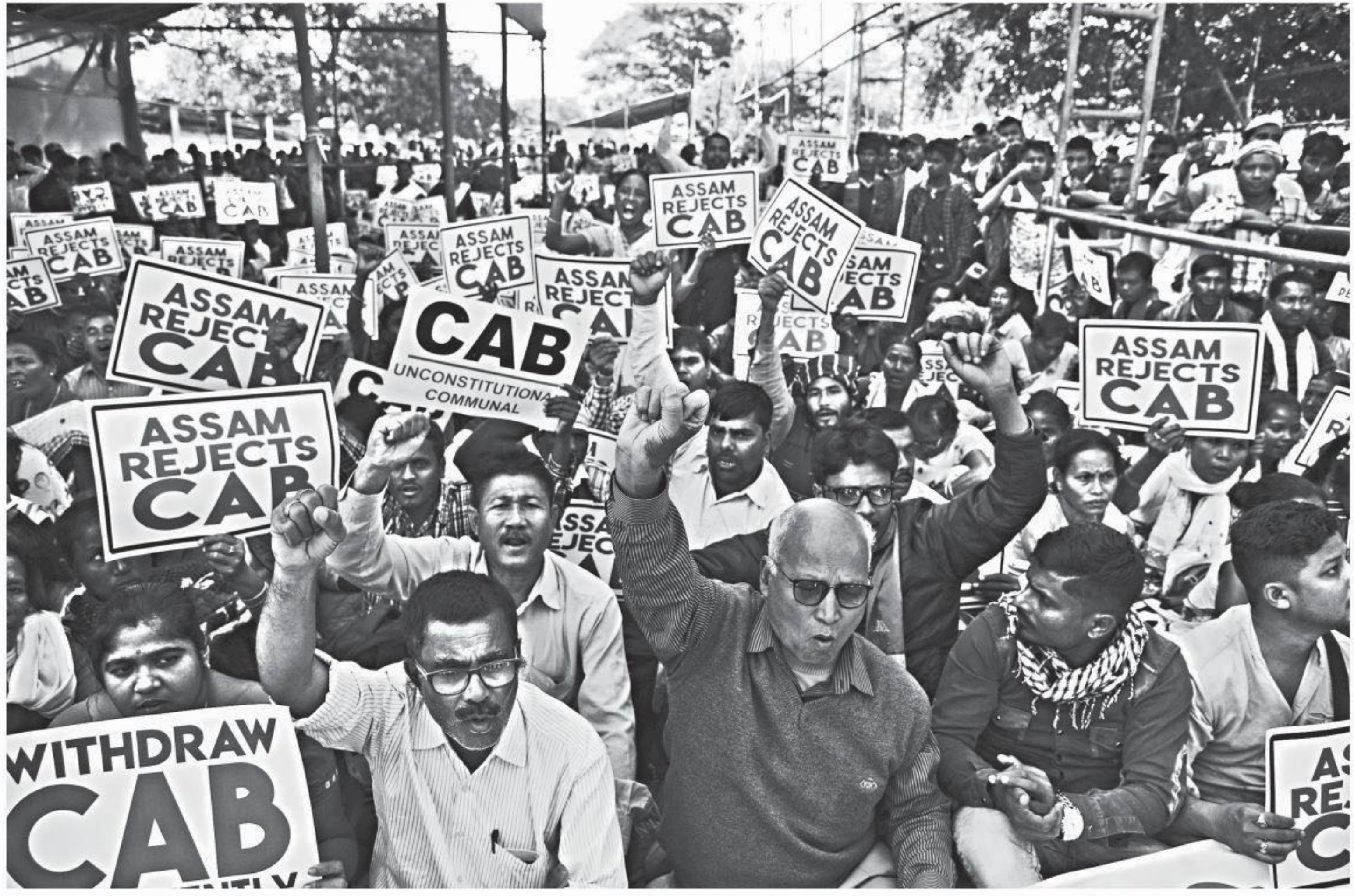
Krishak Mukti Sangram Samiti (KMSS) activists shout slogans during a demonstration against the government's Citizenship Amendment Bill, in Guwahati, India yesterday.