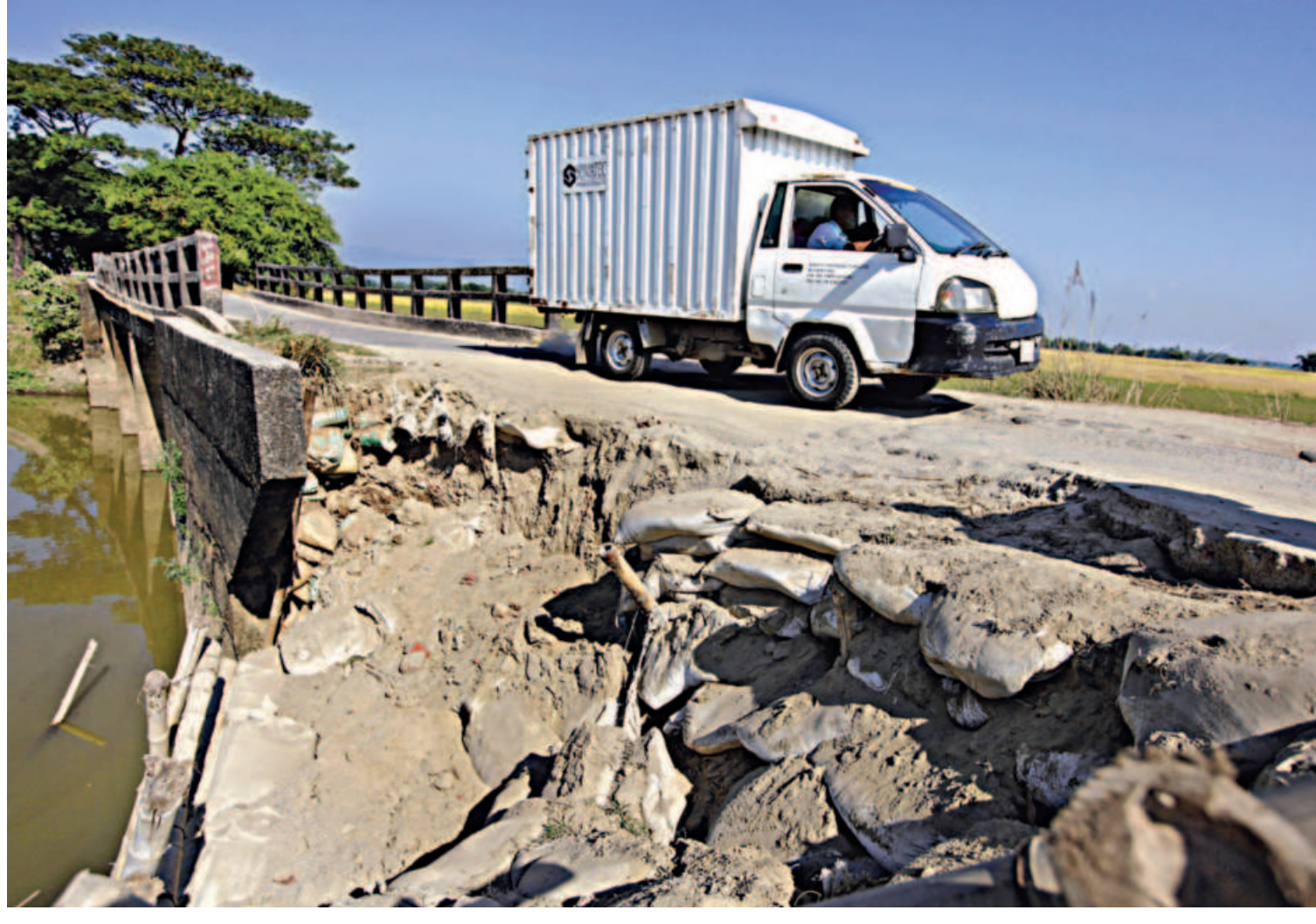
A van crosses a badly damaged bridge in Paschim Jaflong Chotkhel area in Sylhet's Gowainghat upazila yesterday. Locals said part of the bridge's approach road caved in six months ago, after which the LGRD did some makeshift repairs using sandbags and bamboos. Those too were flooded away by recent rains.