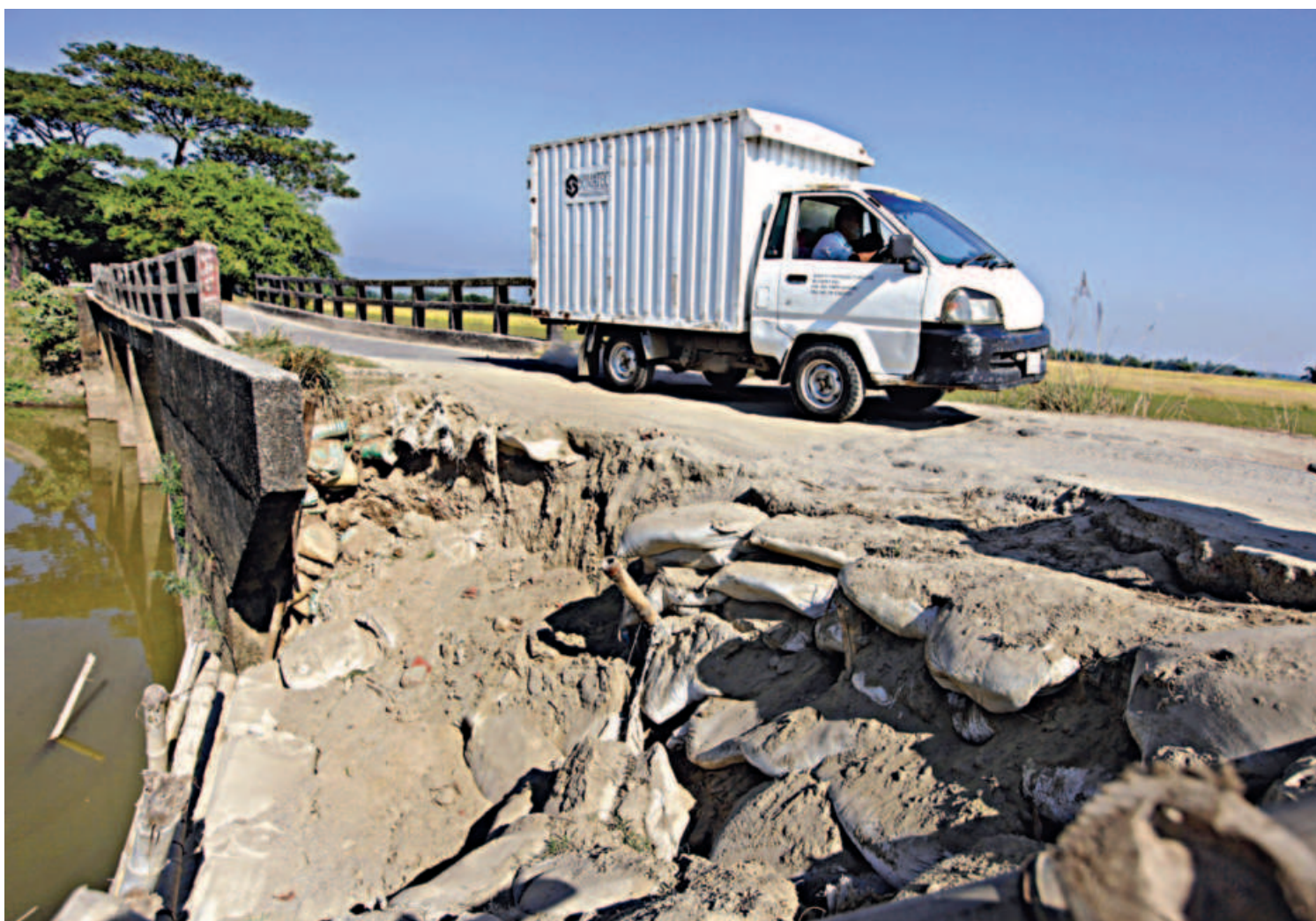
A van crosses a badly damaged bridge in Paschim Jaflong Chotkhel area in Sylhet's Gowainghat upazila yesterday. Locals said part of the bridge's approach road caved in six months ago, after which the LGRD did some makeshift repairs using sandbags and bamboos. Those too were flooded away by recent rains.