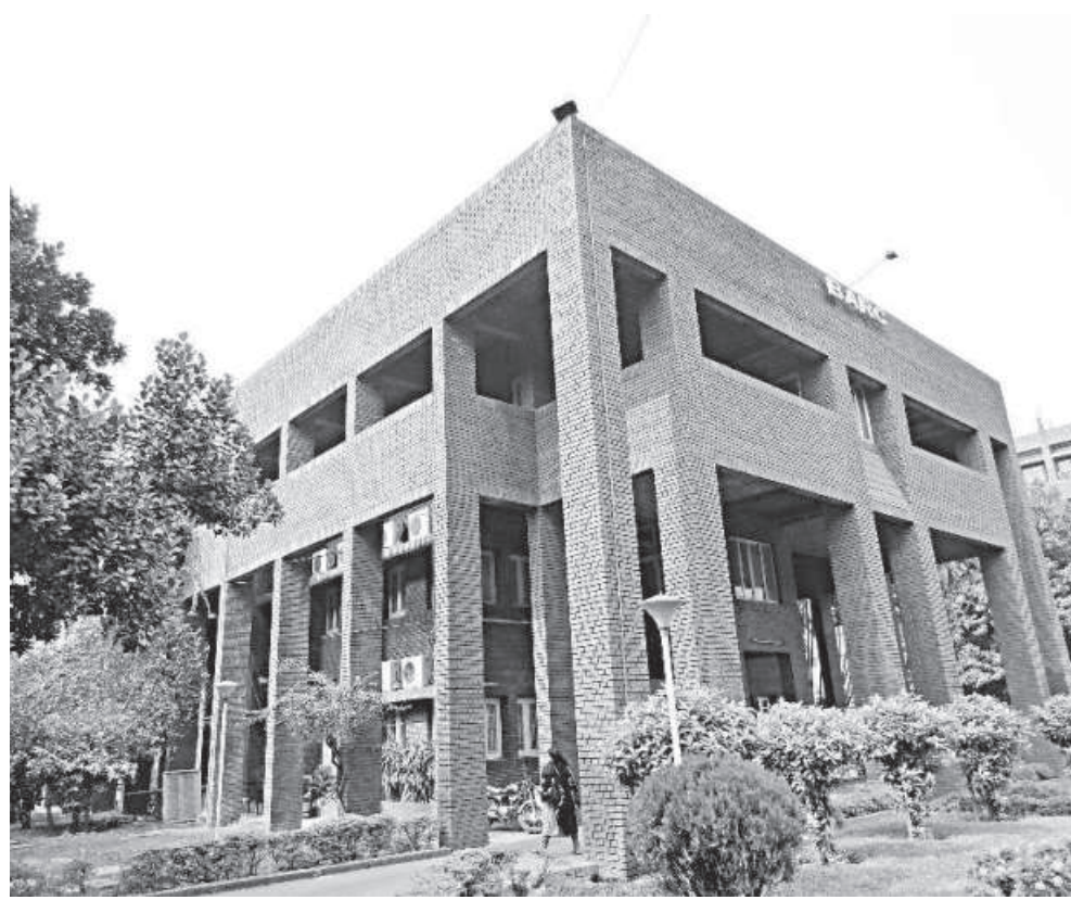
It is difficult to miss the 'poetics' of brick in the conceptualisation and organisation of the BARC headquarters building.