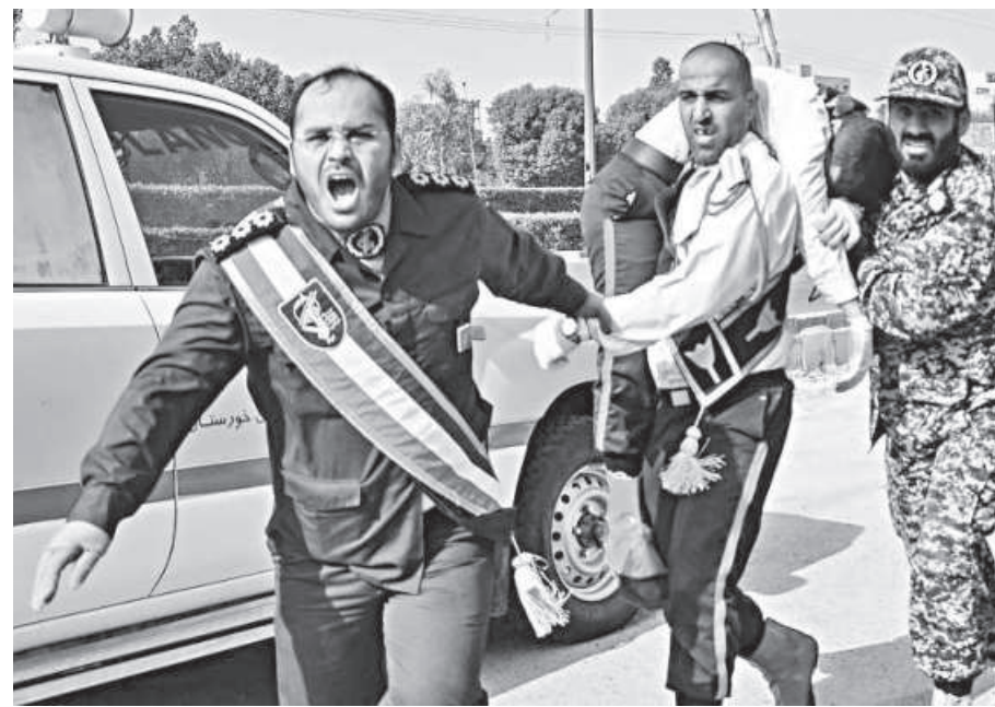
An Iranian soldier carrying an injured comrade at the scene of an attack on a military parade in Ahwaz on September 22, 2018.

Ayatollah Khamenei's insistence that the Iranian protests constituted a "dangerous conspiracy" by the United States was hardly surprising.