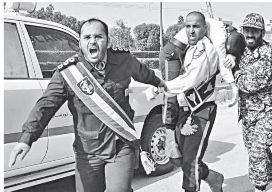
An Iranian soldier carrying an injured comrade at the scene of an attack on a military parade in Ahwaz on September 22, 2018.

Ayatollah Khamenei's insistence that the Iranian protests constituted a "dangerous conspiracy" by the United States was hardly surprising.