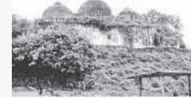
December 6, 1992 Demolition of the Babri Masjid

The Babri Masjid ("Mosque of Babur") in Ayodhya was demolished leading to mass riots throughout India.