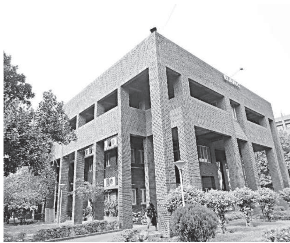
It is difficult to miss the 'poetics' of brick in the conceptualisation and organisation of the BARC headquarters building.

Doxiadis also has employed different gradations of buildings, providing naturally ventilated and thermally comfortable spaces, a sustainable response to tropical conditions. Architect Muzharul Islam—whose office, Vastukalabid, was a rite of passage since the early 1970s for many young architects, including Rabiul Husain—also experimented