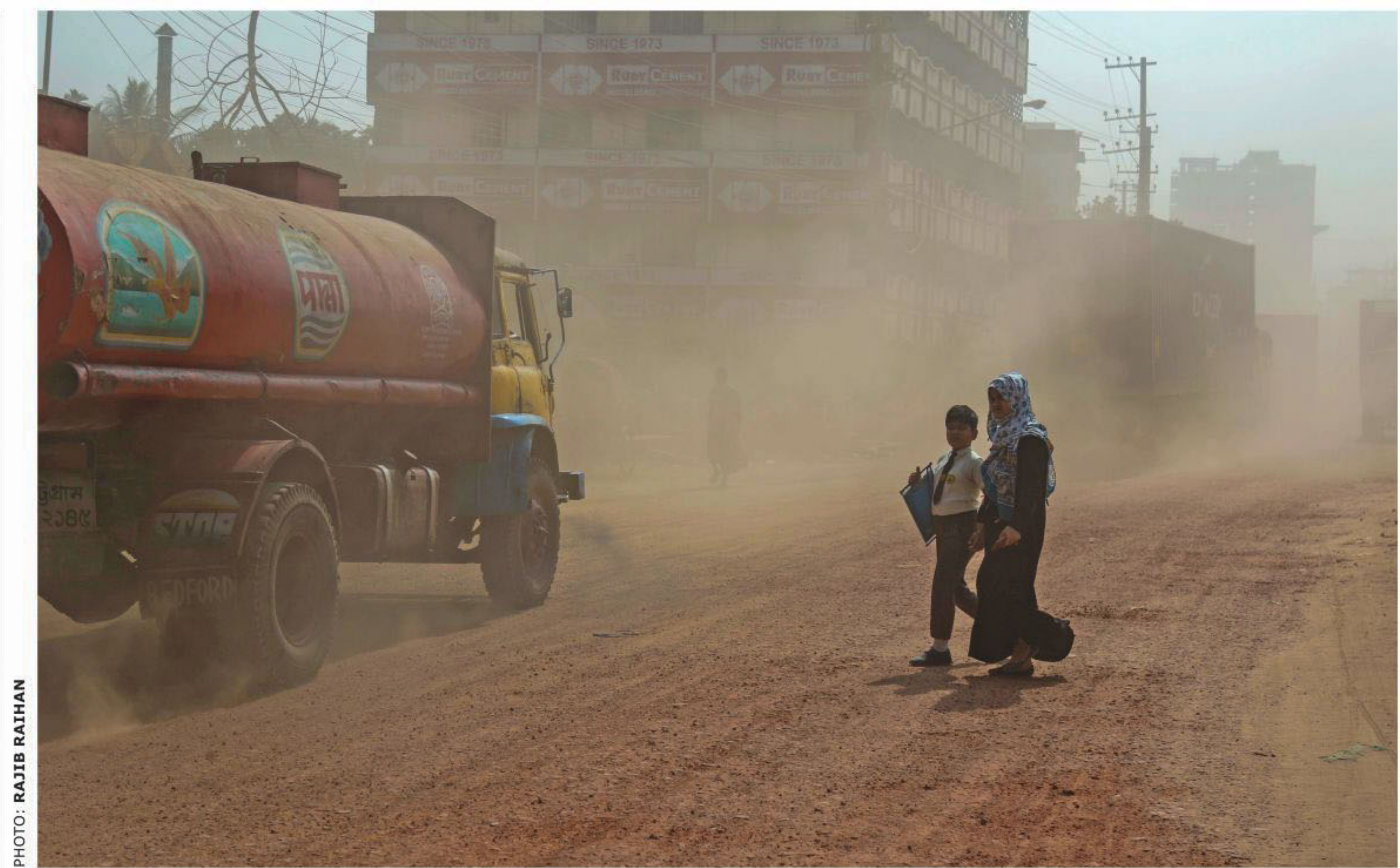
Port Connecting Road in Chattogram city has been undergoing renovation work for the past two years. As the dry season has set in, dust pollution is getting worse -- posing serious health risks. The photo was taken on Tuesday near Nayabazar intersection.