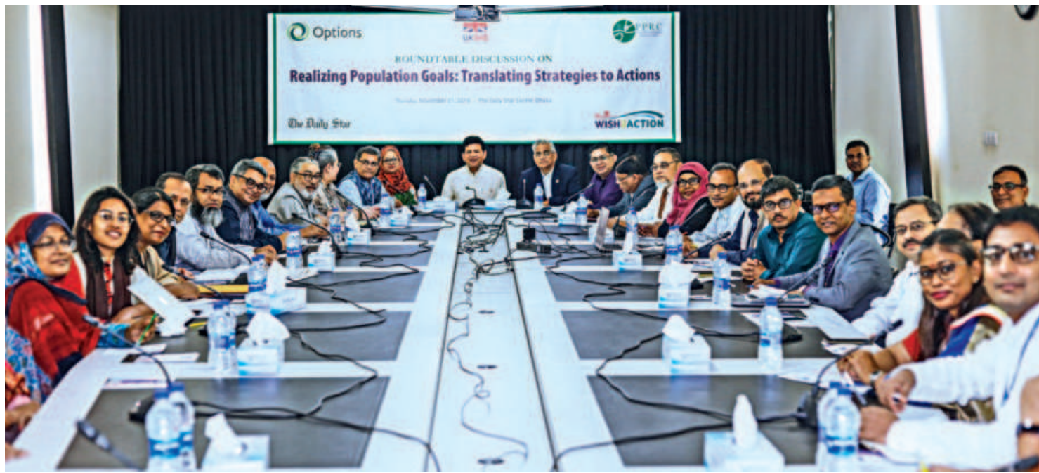
Options Consultancy Services Ltd in association with The Daily Star and Power and Participation Research Centre (PPRC) organised a roundtable titled "Realizing population goals: Translating strategies to actions" on November 21, 2019. Here we publish a summary of the discussion.

Over the last four years (according to statistics of Bangladesh Demographic and Health Survey), there has been upward growth from 38 percent to 50 percent in institution delivery, which is tremendous. The contributors of this are mainly from the private sector. The public sector contribution has increased by one percent during this time while private sector contribution has seen a 10 percent growth. Meanwhile, NGO contribution has increased by two percent. That is directly linked with issues like maternal mortality and family planning. We are at the "last mile" in the journey towards reaching our goals. The policymakers need to change their mindsets in order to prioritise new programmes.