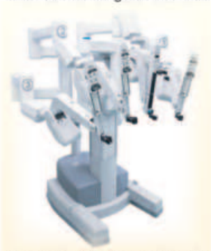
The robotic system's arms, fitted with tiny instruments, are inserted through small incisions into the surgical site.