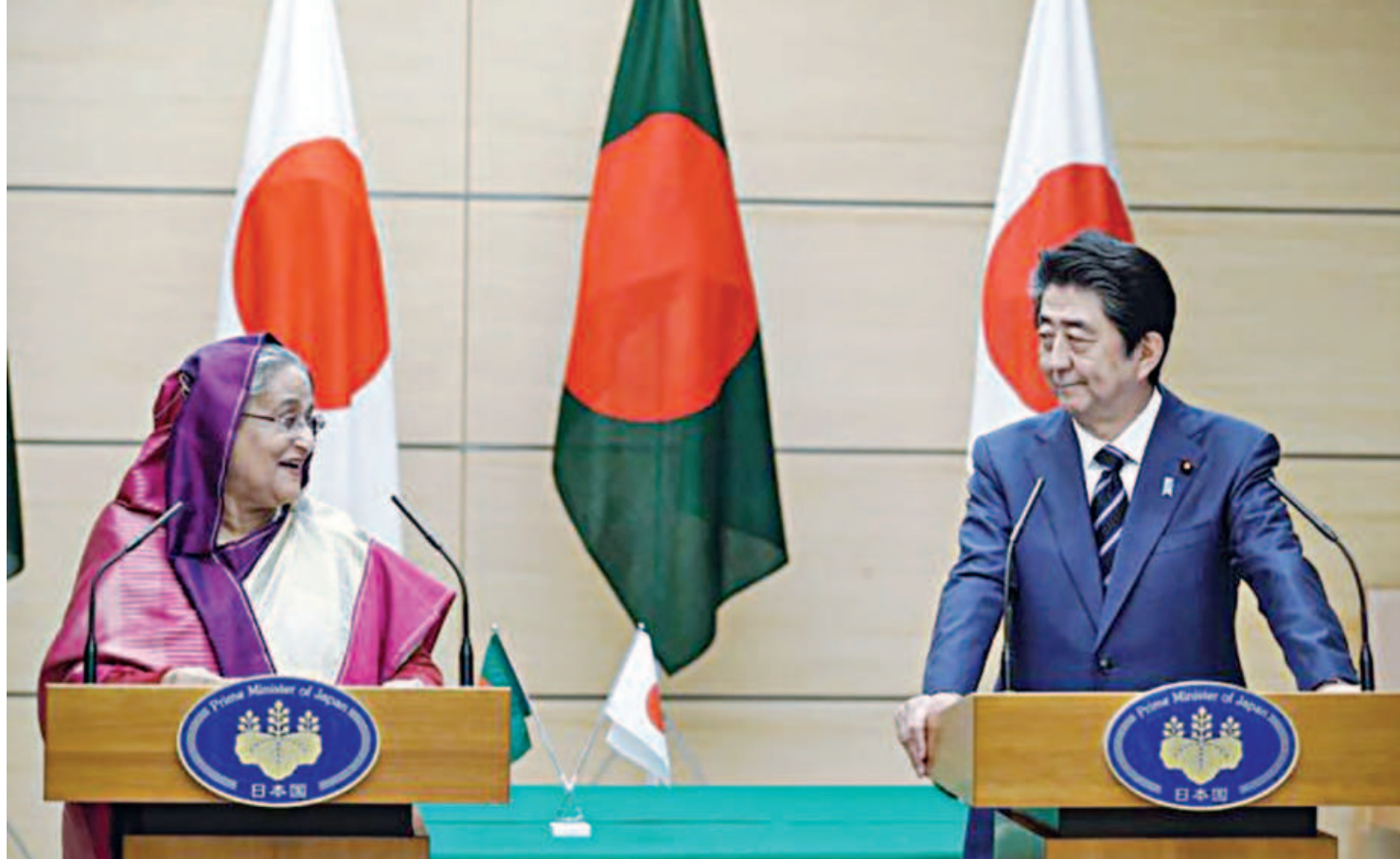
Bangladesh's Prime Minister Sheikh Hasina and Japan's Prime Minister Shinzo Abe attend a joint media conference at Abe's official residence in Tokyo on May 29, 2019.

As maturing domestic value chains and uncertainties around global trade take Japanese supply chains to new ports-of-call, Bangladesh-Japan partnership holds a unique promise: deep ties and familiarity of decades, but new and untapped opportunities. In fact, "G7 to E7: The Standard Chartered Trade Performance Index" predicts that Japanese