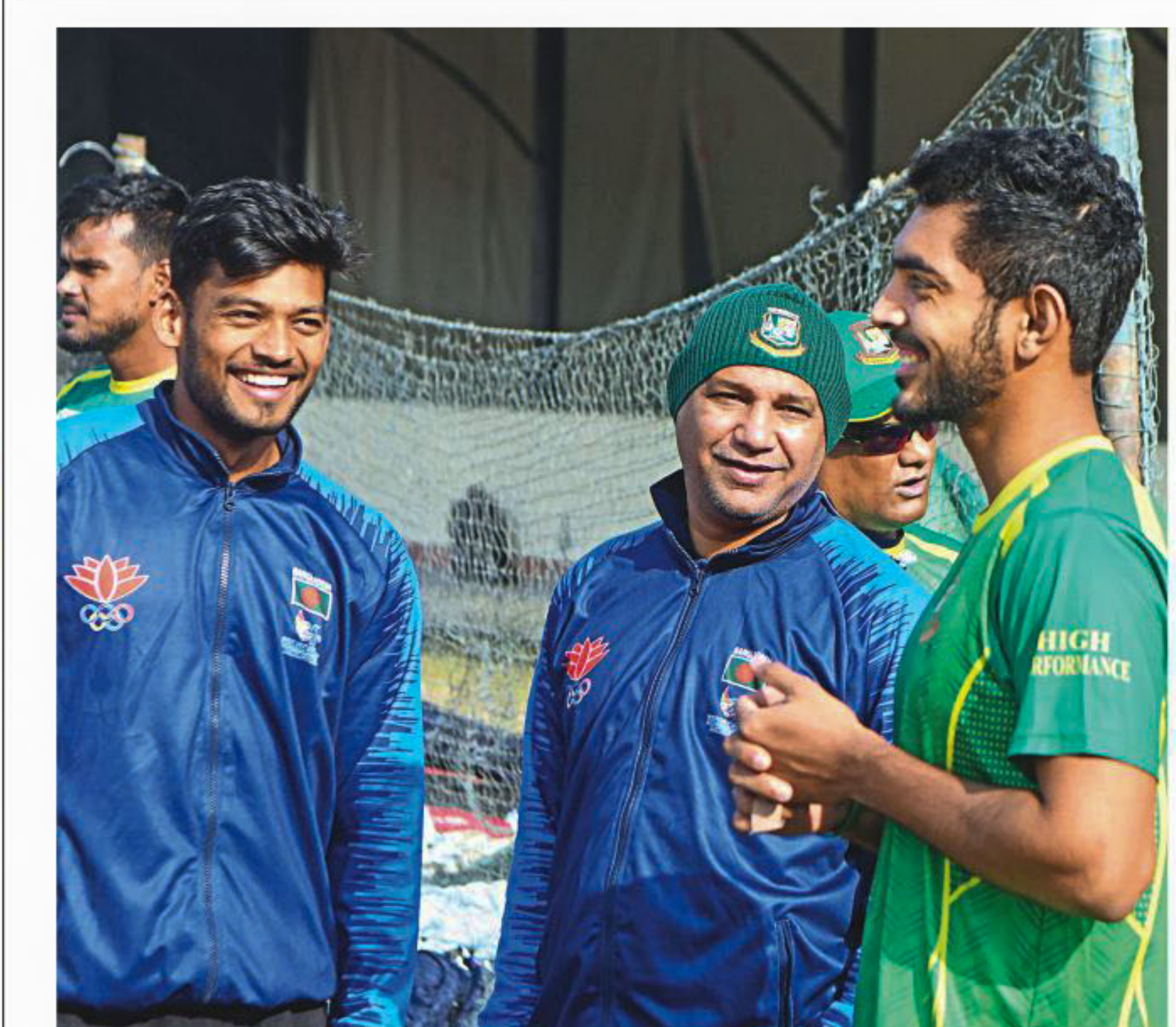
Bangladesh captain Nazmul Hossain Shanto (L) and batsman Saif Hassan (R) are pictured speaking with selector Habibul Bashar ahead of their SA Games T20 cricket event match against Maldives today. Following the national team's dismal run in the just concluded tour of India, perhaps the under-23 team could bring the fans something to cheer about.