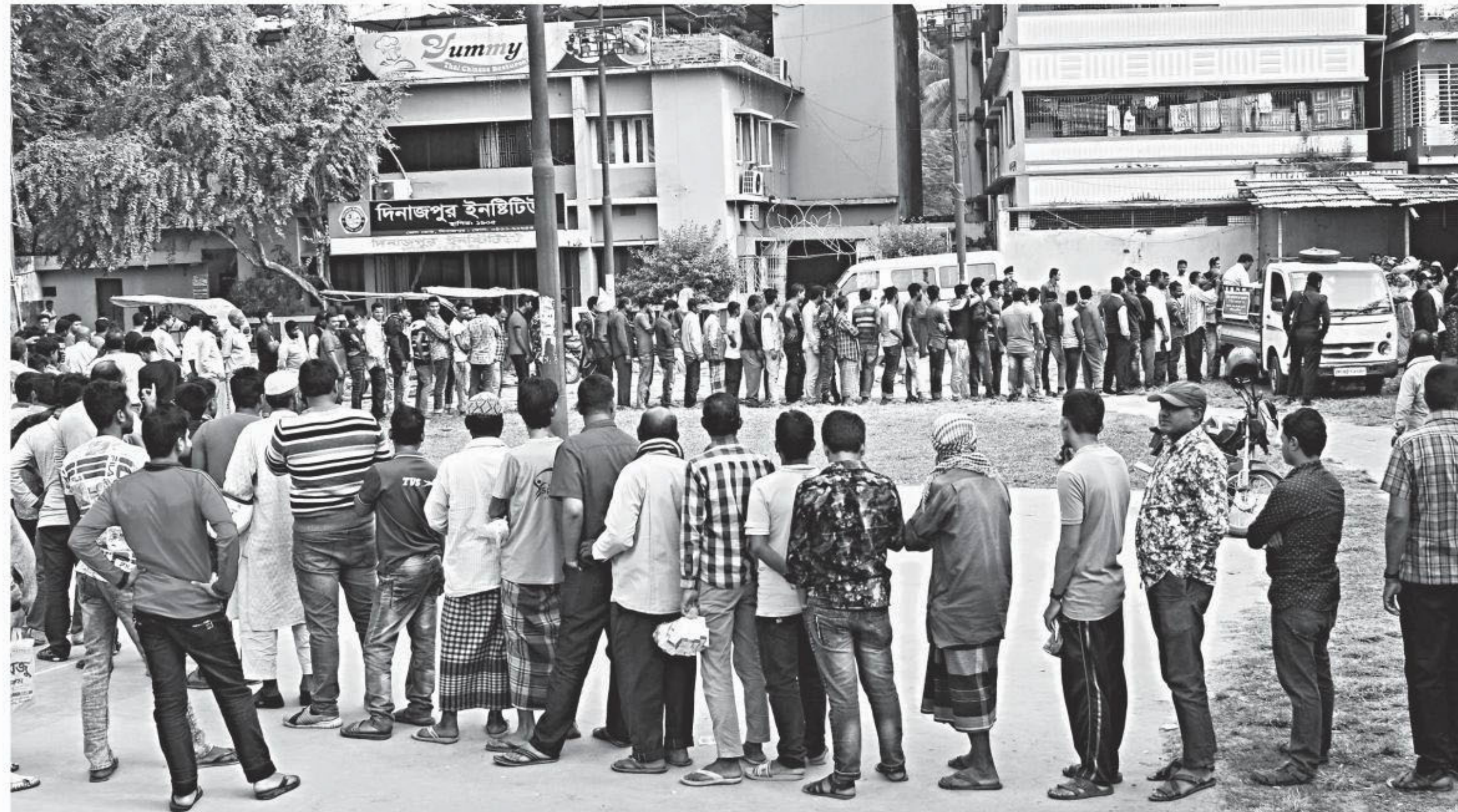
Many people, including solvent ones, stand in a long queue on the premises of Dinajpur Institute yesterday as Trading Corporation of Bangladesh starts selling onion at Tk 45 a kg when the market price of the common cooking ingredient remains over Tk 200 a kg. A good number of them had to leave frustrated after waiting for hours as one tonne of onion brought in a truck for sale was too inadequate to meet the demand.