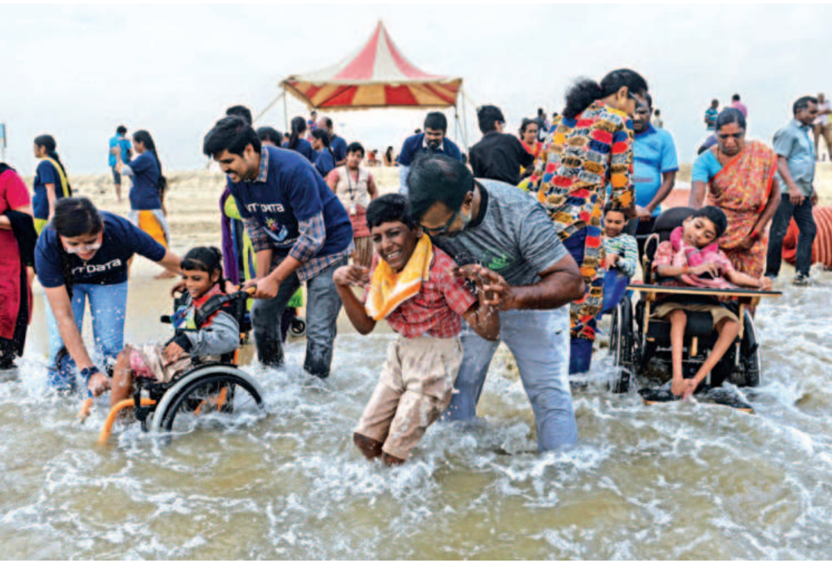
Physically challenged children enjoy at the Marina Beach during an event to mark the International Day of Disabled Persons in Chennai, yesterday.

Bigger European nations languished well behind in the rankings