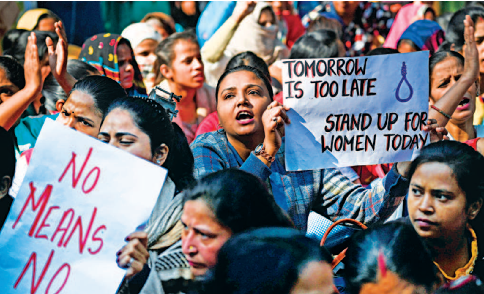
Social activists and supporters shout slogans to protest against the alleged rape and murder of a 27-year-old veterinary doctor in Hyderabad, during a demonstration in New Delhi, yesterday. Sexual violence against women is rife in India, and the latest case recalled the national and international outrage at the gang-rape and murder of a woman by six men on a Delhi bus in 2012.

Sri Lanka’s new president suspended parliament for a month from yesterday ahead of snap elections he wants to call in March to consolidate his sweeping victory. Gotabaya Rajapaksa, 70, is hoping to ride a wave of popularity by calling an election six months before the current parliament’s five-year term expires in August.