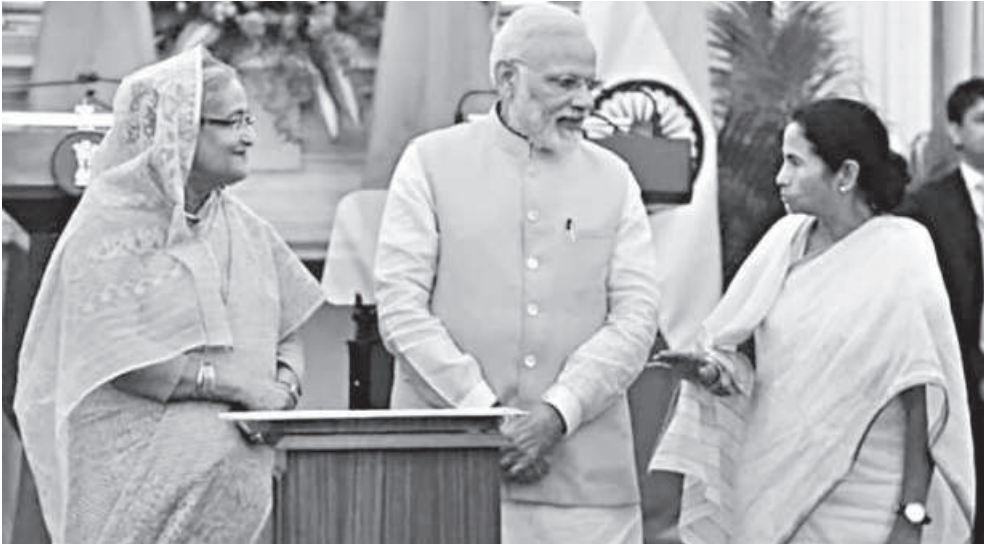
Bangladesh Prime Minister Sheikh Hasina (L) and Indian Prime Minister Narendra Modi (C) listen to West Bengal Chief Minister Mamata Banerjee during an agreement signing ceremony after a meeting in New Delhi, on April 8, 2017.

Many in Bangladesh find Indian official attitude patronising, hectoring, insensitive and largely, if not entirely, self-serving. The propensity to shift goalposts to suit their own convenience is a repetitive theme. There were honourable exceptions to this behavioural pattern, notably during the years of initial bonhomie in the early post-Liberation years (1972-75), during the respective stewardships of the Father of the Nation Bangabandhu in Bangladesh and Mrs Indira Gandhi in India; during the pre-mid-term period of the Deve Gowda-Inder Gujral government in India and Prime Minister Sheikh Hasina's first term in office in Bangladesh, when the signing of