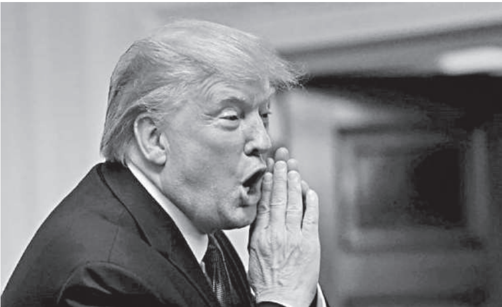
US President Donald Trump's disingenuousness marks a new high in the art of political manipulation.

As noted above, when lies are repeated persistently by powerful men and women, they begin to sound like "truth". Also, these