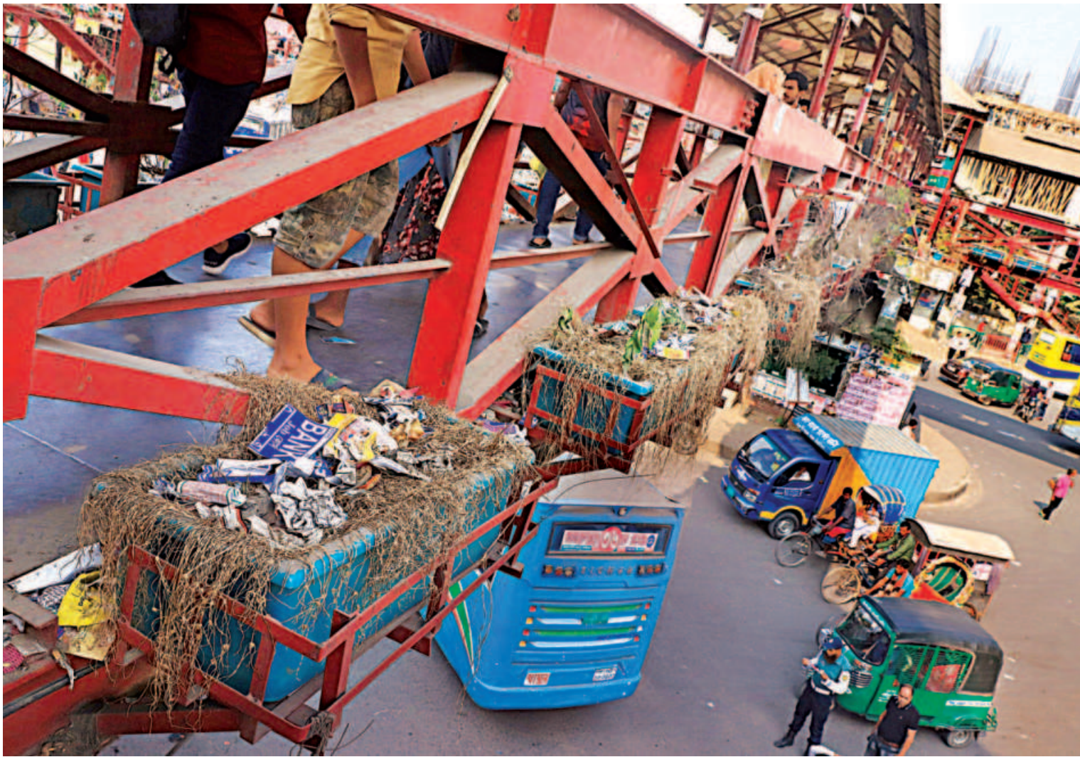
The footbridge at Mirpur-10 roundabout in the capital is in a sorry state. Plants in the flower pots have died due to lack of care and the pots have become trash bins. The photo was taken yesterday.