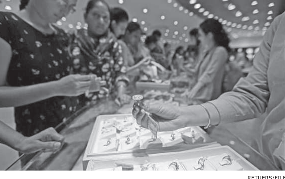
A sales person shows a gold ring to customers at a jewellery showroom in Ahmedabad.

Gold started trading at a premium in India to the official domestic price last month for the first time in 5-1/2 months on an improvement in demand from jewellers, which prompted refiners to increase gold dore imports, said a Mumbai-based bullion dealer at a gold importing bank.