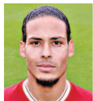
VIRGIL VAN DIJK