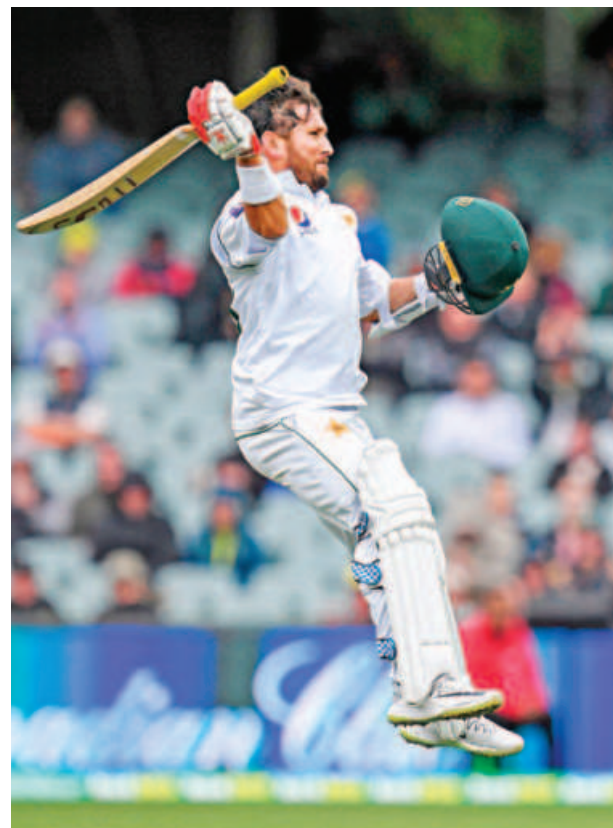
Pakistan bowler Yasir Shah may have stunned everyone with his maiden Test century on the third day of the second Test against Australia but it went in vain as the visitors were forced to follow on in Adelaide yesterday.