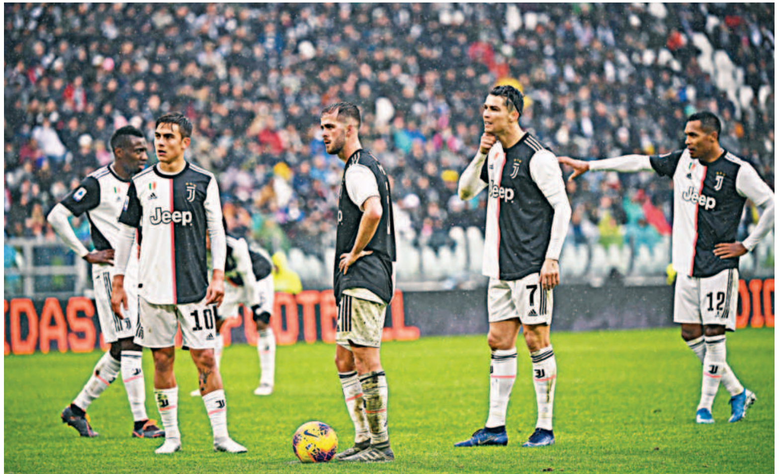
After Sassuolo's Jeremie Boga and Francesco Caputo put the side ahead with first-half strikes, Juventus star Cristiano Ronaldo (2nd from R) came in with a 68th minute penalty to help salvage a 2-2 draw in a Serie A encounter at the Juventus Stadium in Turin yesterday.

Later, Inter host SPAL with third-placed Lazio at home against Udinese and city rivals Roma at Verona.