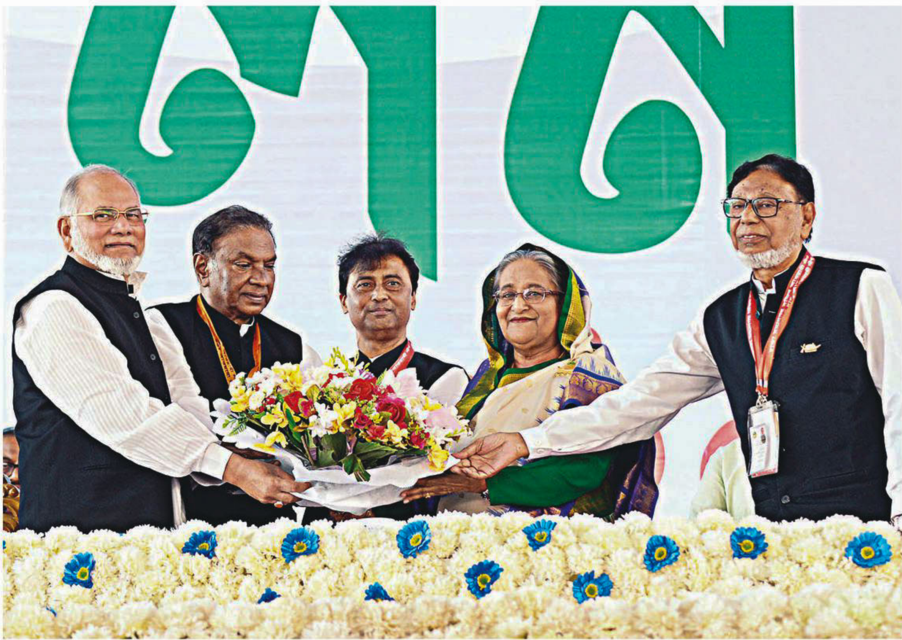
Awami League chief Sheikh Hasina receives a bouquet from senior AL leaders at the inauguration of the party's Dhaka north and south units' council in the capital's Suhrawardy Udyan yesterday. Related story on page 2.