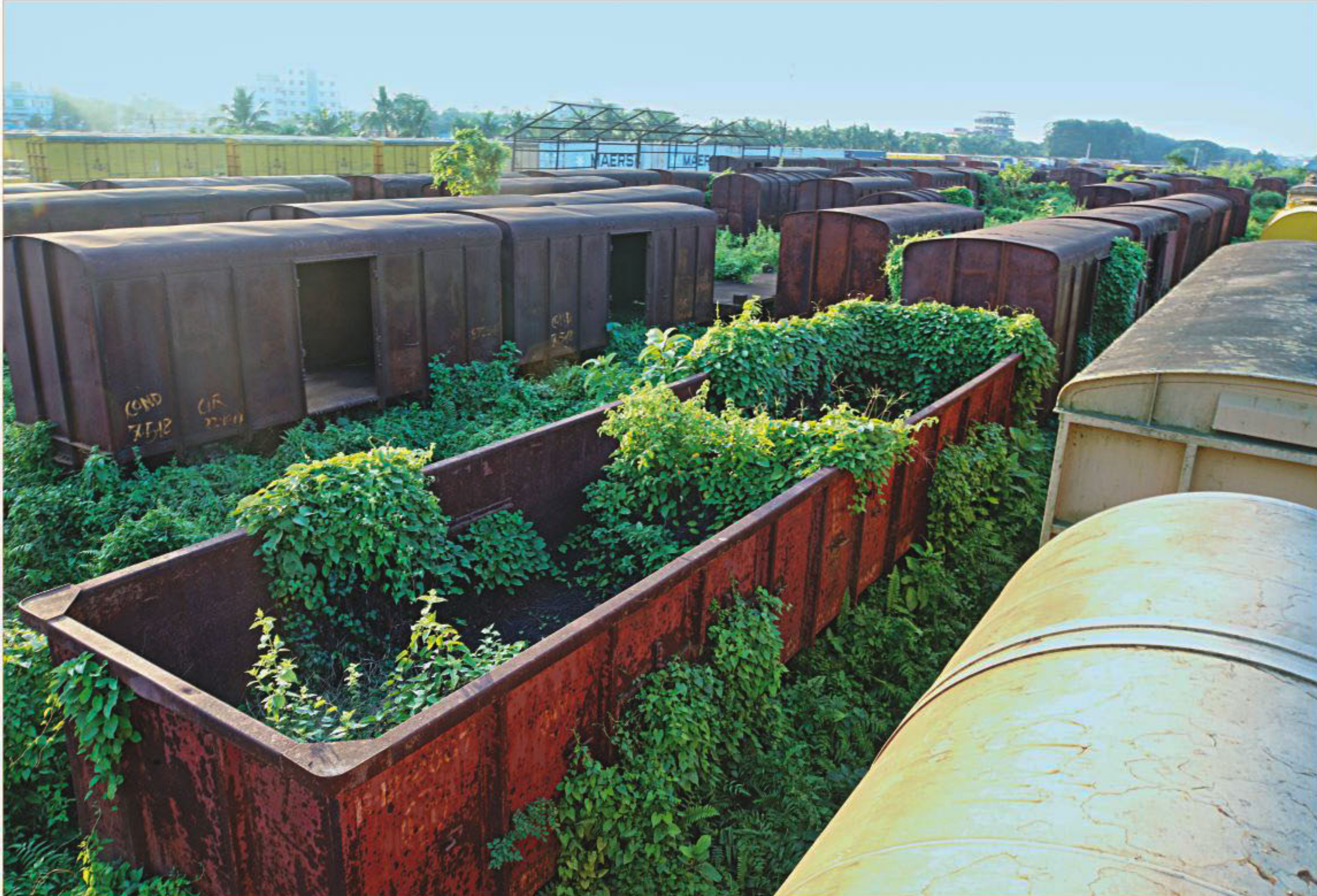
Wagons, decommissioned by Bangladesh Railway, lie covered in weeds and gather rust at a storage spot of Chattogram Port Yard in the port city. None of these was even put up for auction and in this state their value depreciates every day as no maintenance work is done.