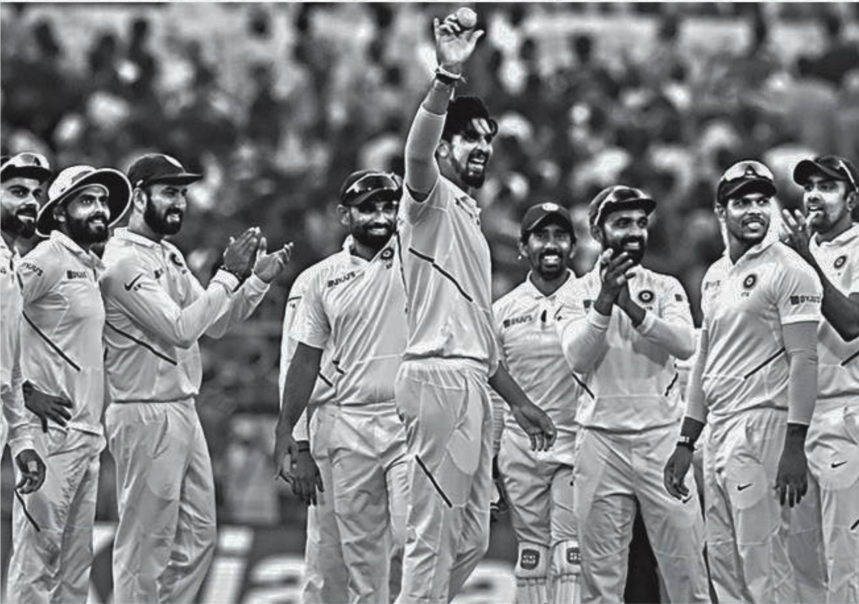
Ishant Sharma celebrates after completing his five-wicket haul.

Ignoring such a tawdry fairy-tale narrative, the Board should have had the foresight to purchase several dozen pink balls to give our boys the feel and a sound preparation on a "bouncy wicket". The latter should have been reported had BCB employed professional cricket spies instead of relying on shopaholics of the other