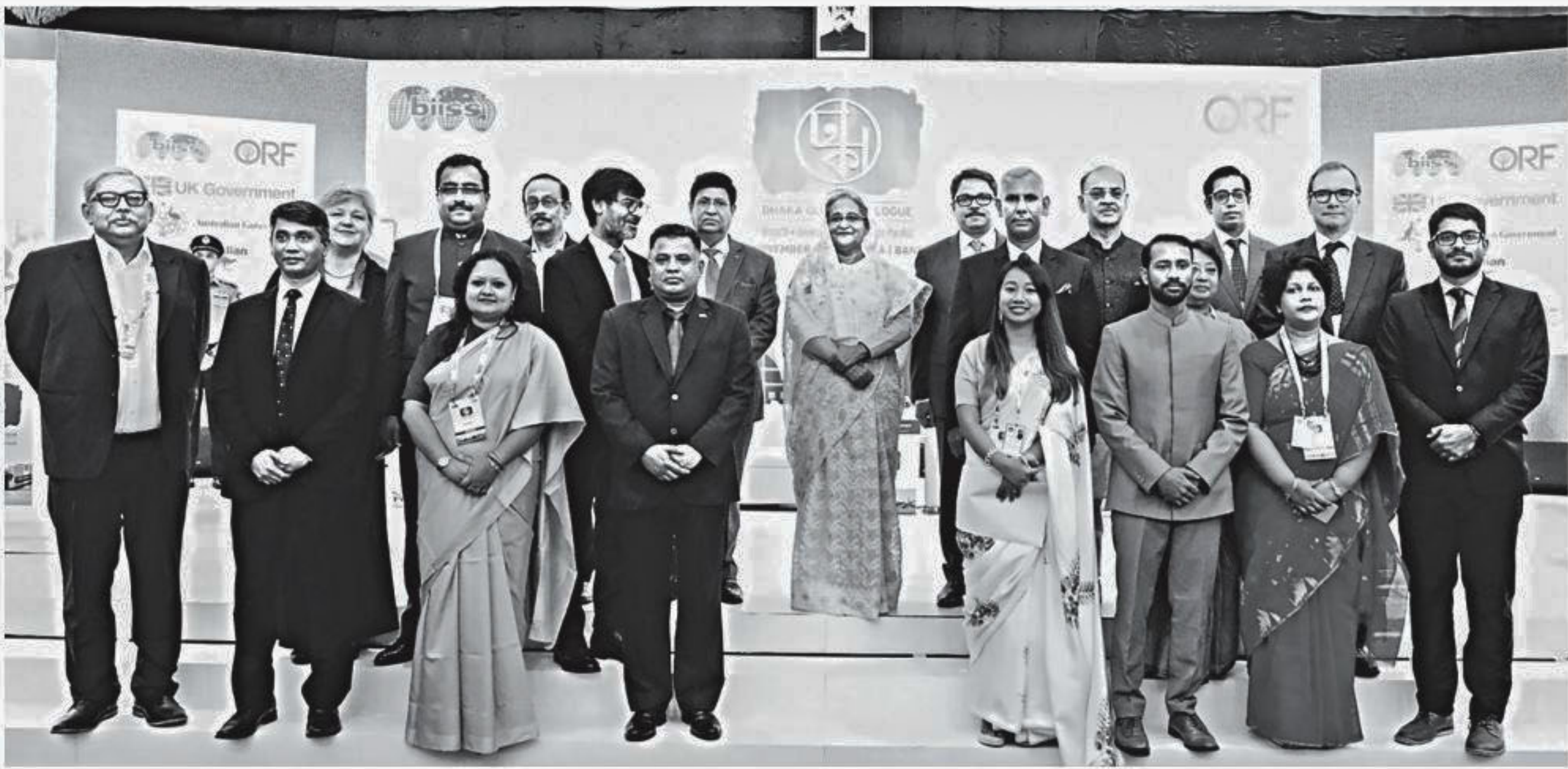
Prime Minister Sheikh Hasina poses for a photo with dignitaries and organisers during the inauguration of the three-day "Dhaka Global Dialogue-2019".

The event was inaugurated on November 11 by the prime minister, thereby giving the process a strong seal of political endorsement from the Bangladesh government. The presence of Mr Ram Madhav Varanasi, National Secretary General of the ruling Bharatiya Janata Party of India, and of Mr Manish Tewari of the Indian National Congress Party, as panellists, signalled the bipartisan support of the Indian political establishment to the process. Speaker of the Bangladesh Parliament Shireen Sharmin Chaudhary's keynote address on the second day focused on the role of parliamentary diplomacy in strengthening people to people relationship among countries. A host of cabinet ministers and parliamentarians from Bangladesh, including the