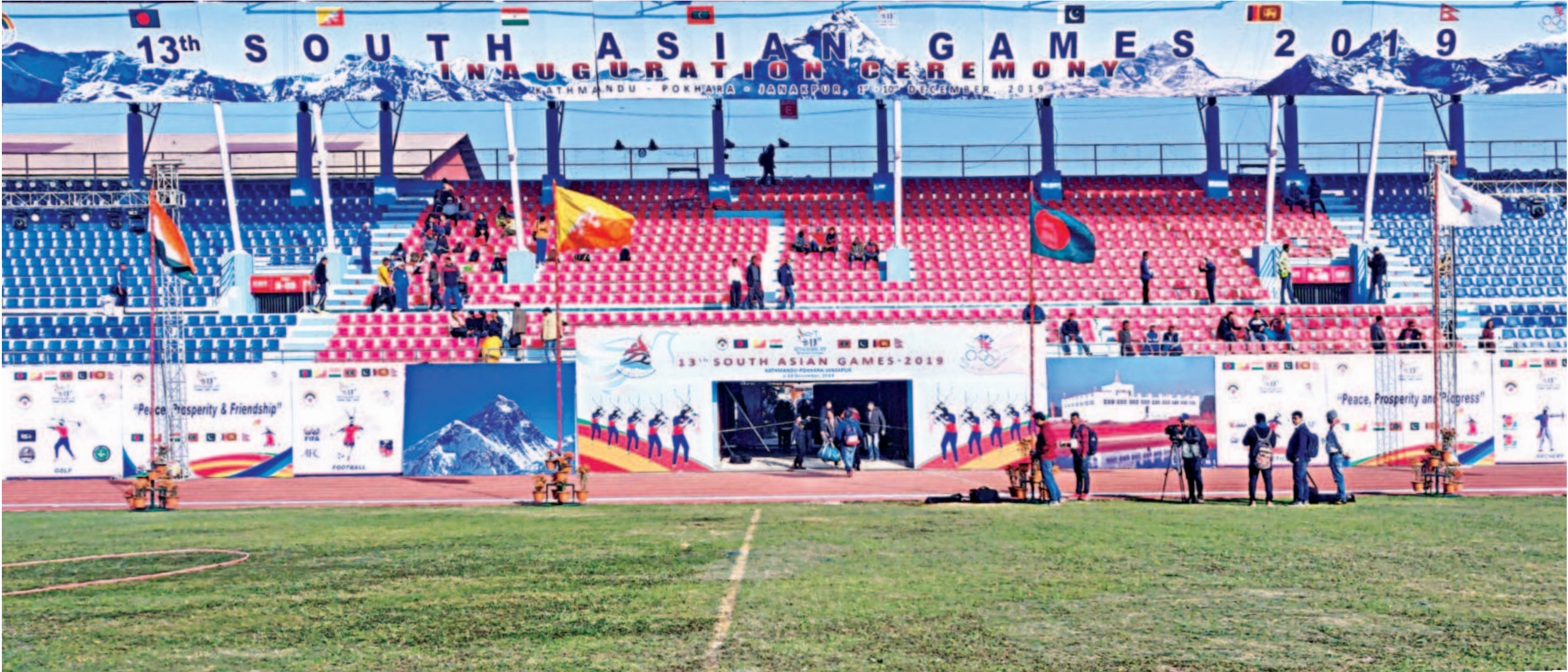
The Dasarath Rangasala in Kathmandu, which turned into a heap of rubble following the devastating earthquake in 2015, has been rebuilt from scratch just in time to host the opening ceremony of the 13th South Asian Games as well as the football and athletics events.