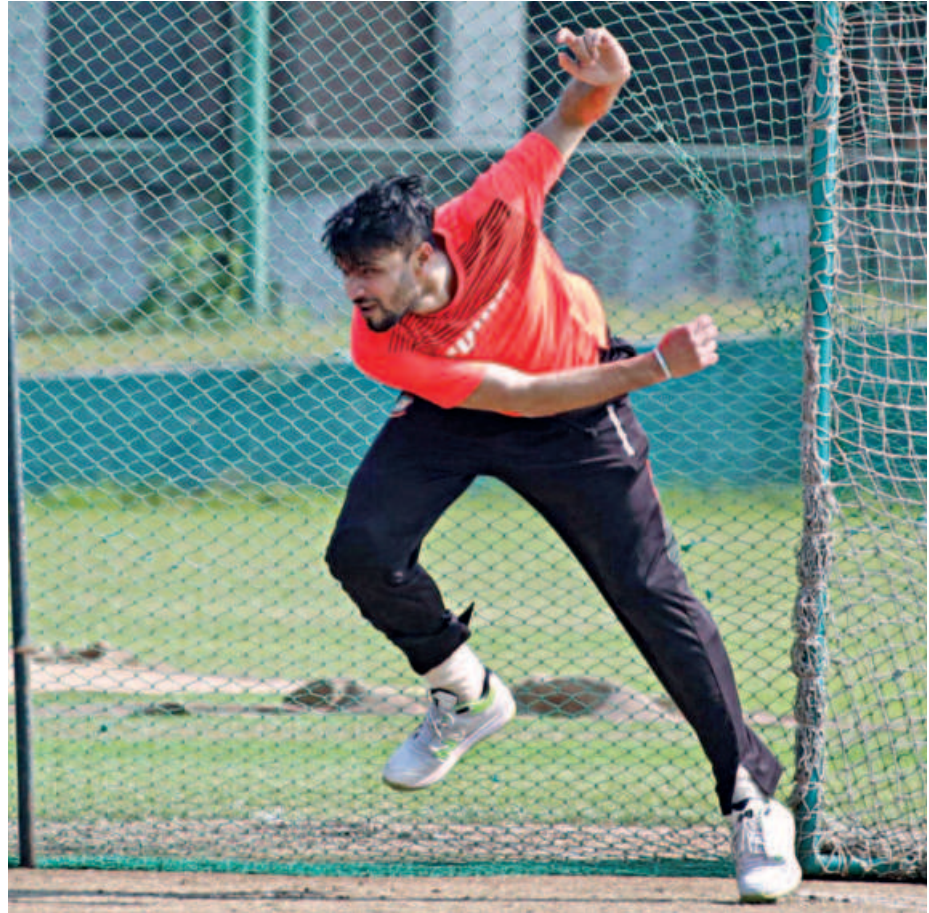
Bangladesh ODI captain Mashrafe Bin Mortaza returned to the nets for the first time since his injury yesterday and bowled four overs. He is expected to be fit from the start of the Bangabandhu Bangladesh Premier League.

The top two teams from the round-robin stage will play in the final, scheduled for December 10 at the Dasarath Rangasala.