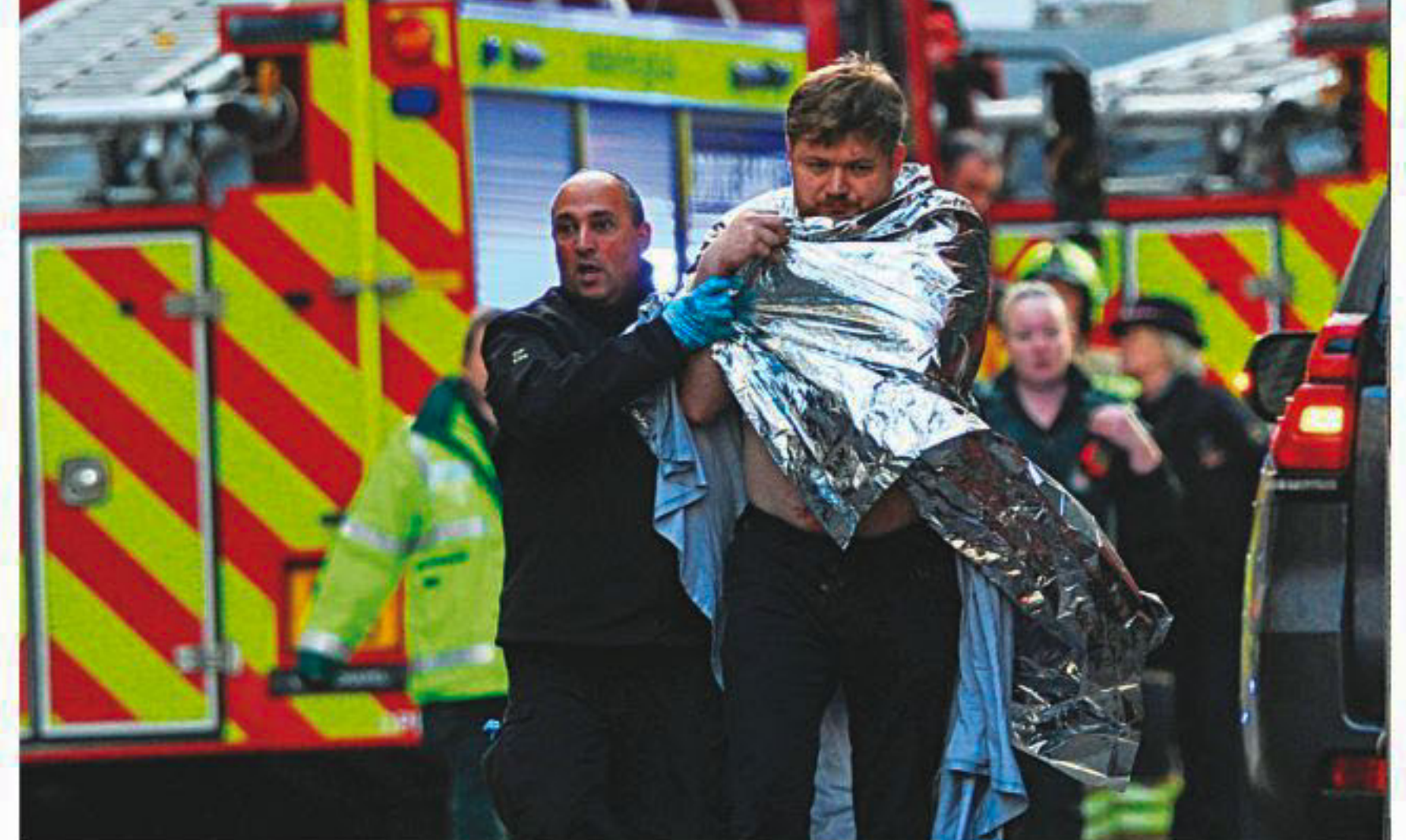
A member of police assists an injured man near London Bridge after a knife attack yesterday.