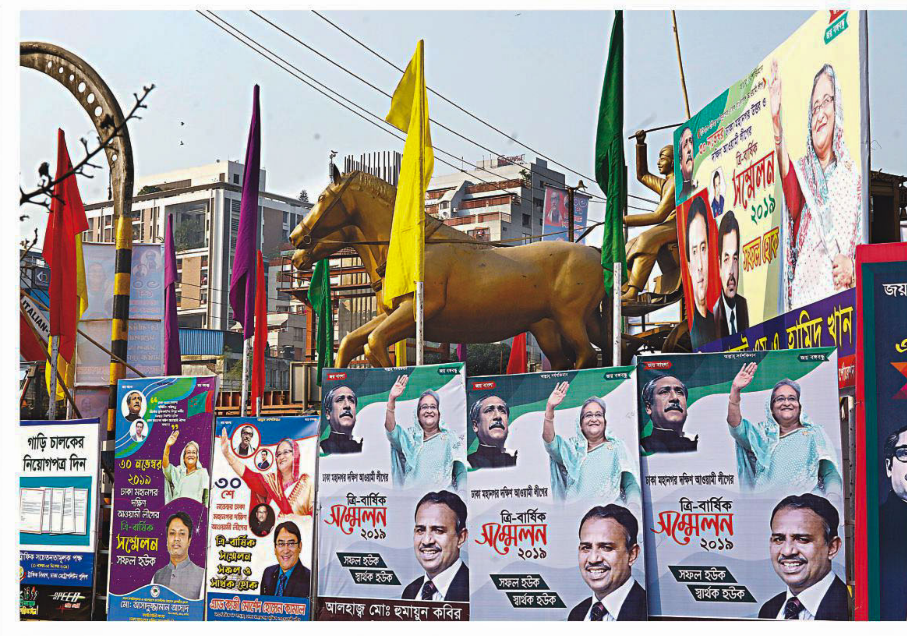
Numerous placards have been put up near hotel InterContinental Dhaka, marking today's triennial council of Dhaka South City Awami League. The content of the placards is a testimony of personal campaigns by the ruling party men. Such display of placards is spoiling the beatification of many areas in the city. The photo was taken yesterday.