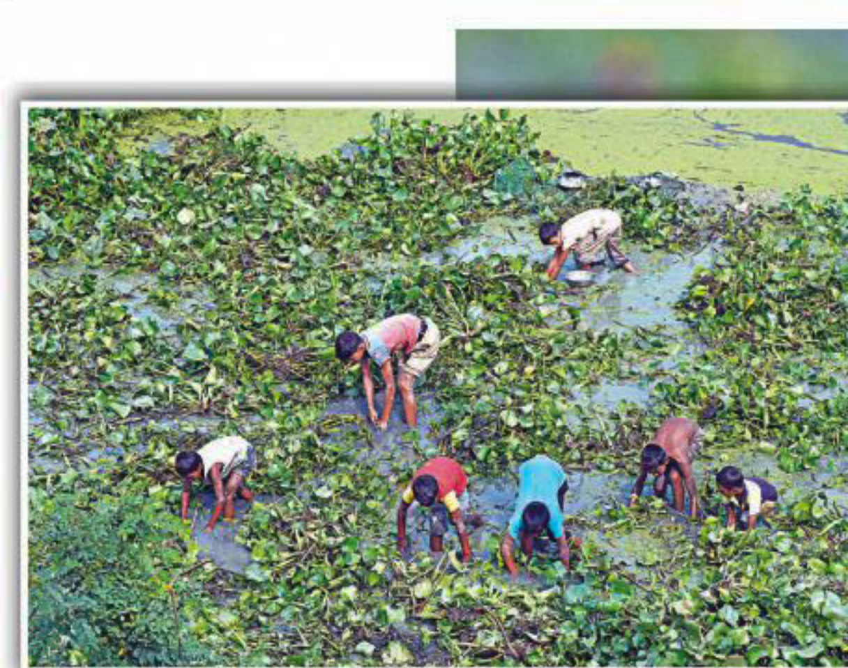
CATCH OF THE DAY! With water receding during winter, catching fish from this ditch in Savar has become a favourite pastime for adults and children alike. The photo was taken at Baniapur area recently.