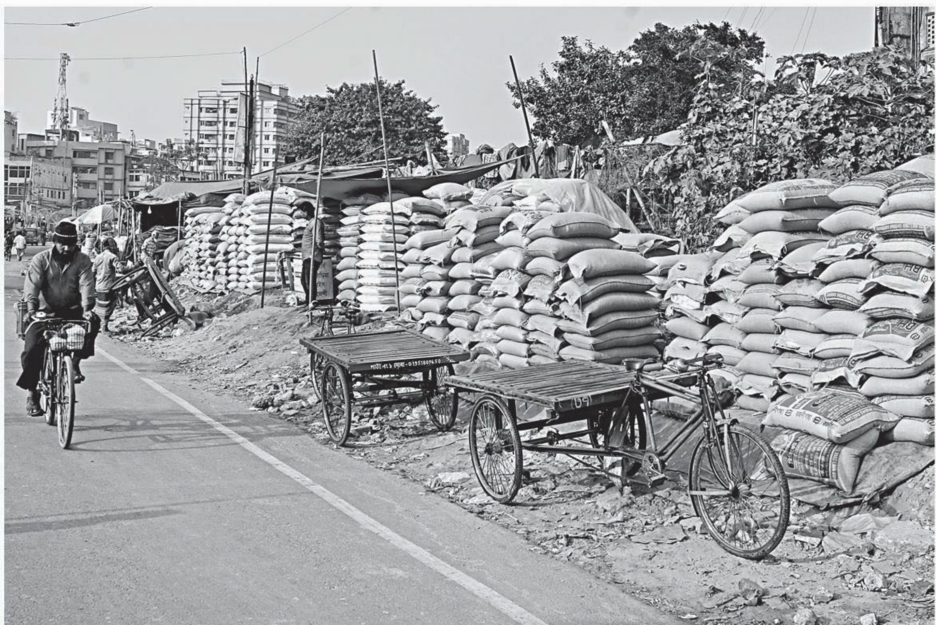
Even after multiple evictions, rice traders come back to set up their shops once again, storing the bags beside the railway. This photo was taken yesterday in the capital's Karwan Bazar.