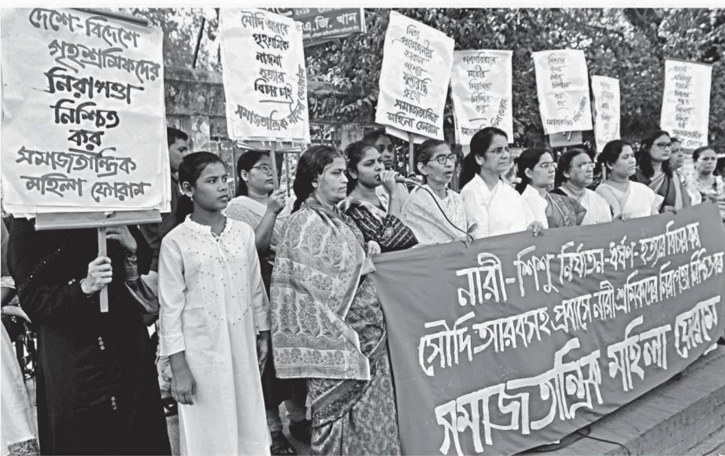
Protesting violence against women and children, Samajtantrik Mahila Forum formed a human chain in front of Jatiya Press Club yesterday. They also urged the government to ensure safety of female migrant workers.

The commission will be an autonomous body like Anti-Corruption Commission and will be able to summon any person for interrogation, he added.