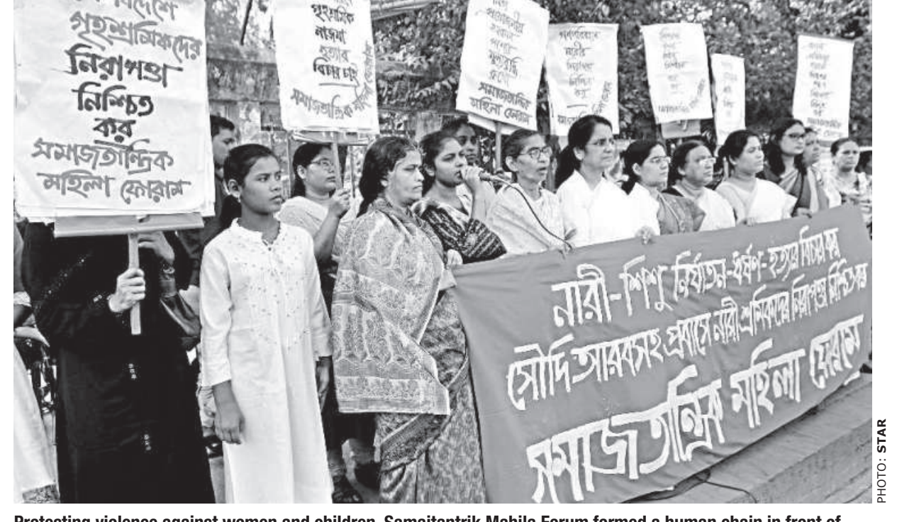
Protesting violence against women and children, Samajtantrik Mahila Forum formed a human chain in front of Jatiya Press Club yesterday. They also urged the government to ensure safety of female migrant workers.