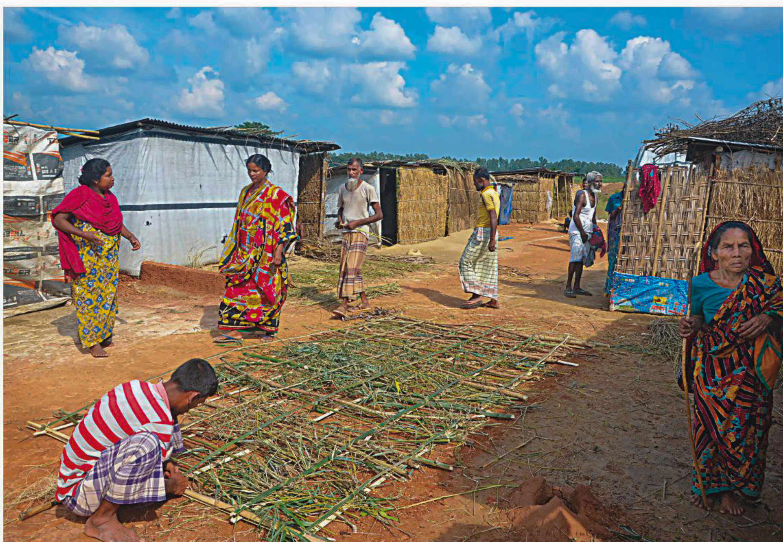
A man works with hay and bamboo to build a home inside Shahebganj-Bagda cane farm in Gaibandha's Gobindaganj upazila. Some of the 1,200 Santal families evicted from the farmland in 2016 have returned recently.