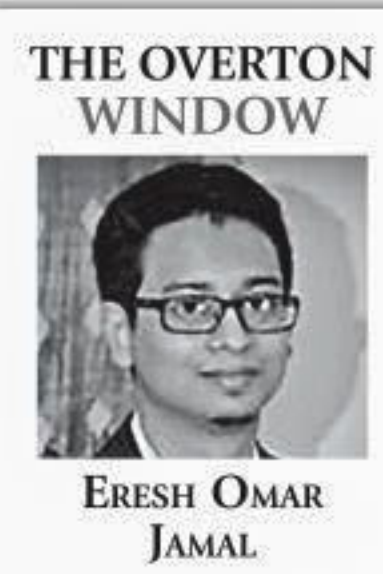
THE OVERTON WINDOW ERESH OMAR JAMAL

NOVEMBER 29 marks the darkest day in history for the people of Palestine, for it was on this day in 1947 that the United Nations General Assembly passed Resolution 181 (II) to end the British mandate in Palestine by August 1, 1948. At the centre of this historic resolution was the decision to partition Palestine and establish, after a transition period, "Independent Arab and Jewish States and the Special International Regime for the City of Jerusalem."