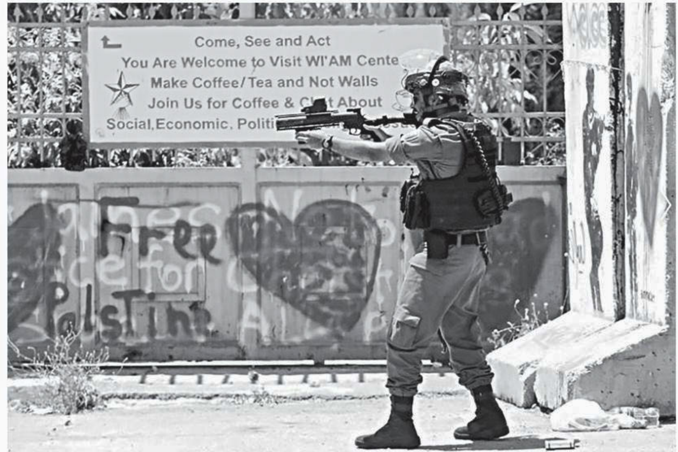
An Israeli border policeman aims his weapon during a protest in support of Palestinian prisoners on hunger strike in Israeli jails, in the West Bank town of Bethlehem, May 12, 2017.

For more than 70 years now, both Israel and its western allies have worked tirelessly and systematically to erase Israeli oppression of Palestinians. An investigative report by the Haaretz newspaper in Israel, details how Israel's ministry of war's secretive security department (Malmab) has been tasked with making the "Nakba"—the catastrophe of 1948 for Palestinians—disappear ("Burying the Nakba: How Israel Systematically Hides Evidence of 1948 Expulsion of Arabs", July 5, 2019). The report says: "Its [Malmab] teams