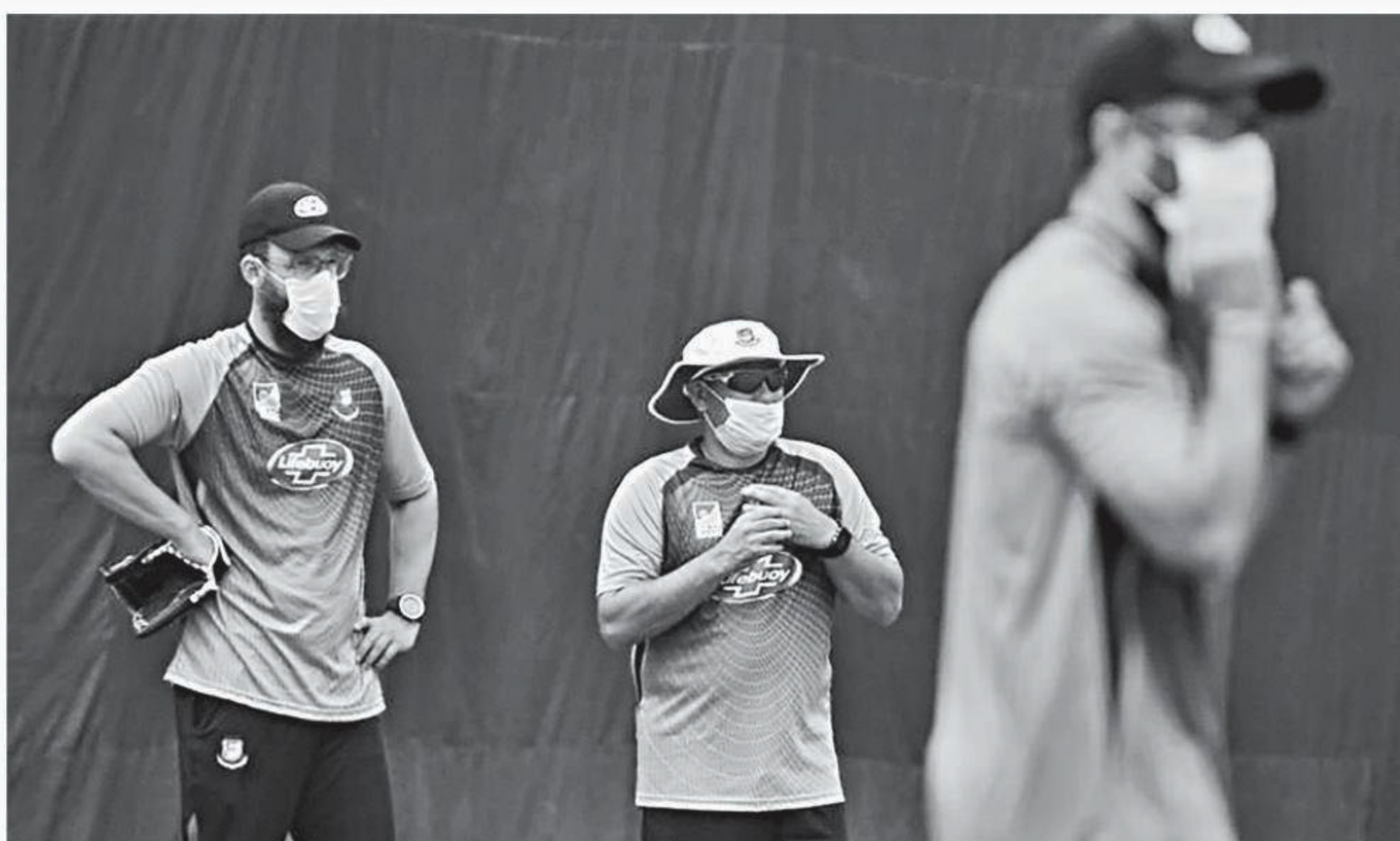
Bangladesh's bowling coach Daniel Vettori, head coach Russell Domingo and batting coach Neil McKenzie wearing masks look on during a practice session ahead of their Twenty20 cricket match against India in New Delhi, India, November 1, 2019.

But Bangladesh beat India in another three-day match. According to the Air Quality Index, the air of Dhaka was the most polluted in the world