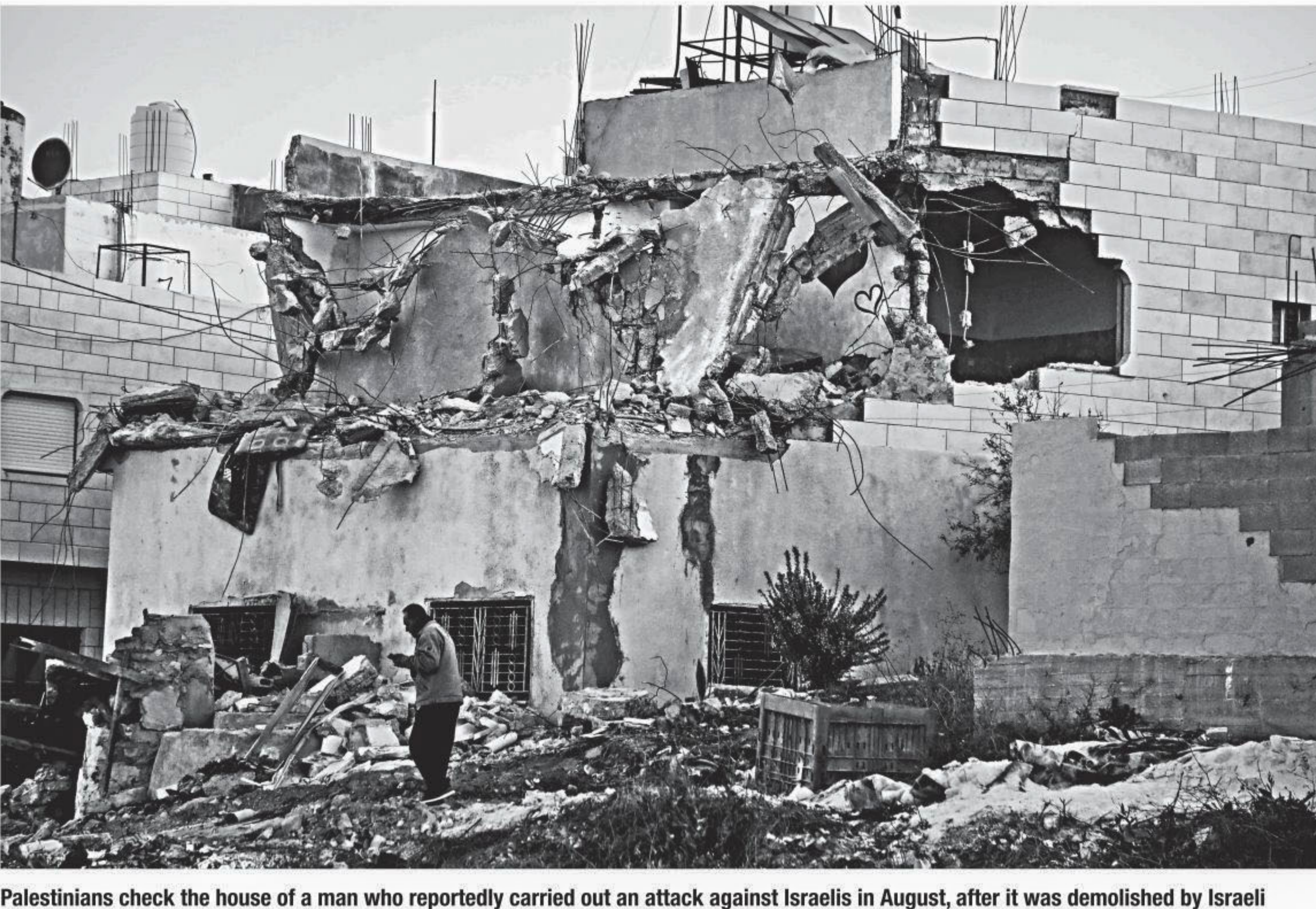
Palstinians check the house of a man who reportedly carried out an attack against Israelis in August, after it was demolished by Israeli authorities yesterday, in the village of Beit Kahel near the West Bank town of Hebron.

AFP, Istanbul Two Turkish soldiers died when a mortar hit their post on the Syrian border, the defence ministry said yesterday. "Two of our fellow comrades were martyred by a mortar attack" in Akcakale town, Sanliurfa province, on Wednesday, the ministry said in a statement. It did not specify if the attack came from Syrian territory, but said Turkish forces responded with intense artillery fire. Akcakale lies adjacent to areas that were targeted in Turkey's offensive against Kurdish militants.