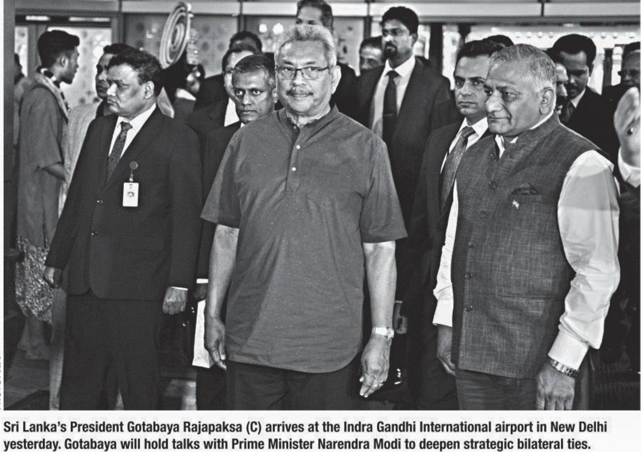
Sri Lanka's President Gotabaya Rajapaksa (C) arrives at the Indra Gandhi International airport in New Delhi yesterday. Gotabaya will hold talks with Prime Minister Narendra Modi to deepen strategic bilateral ties.