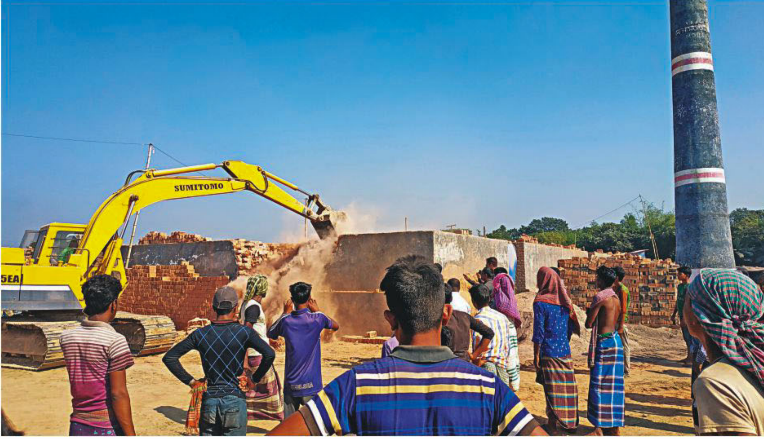
An illegal brick kiln being dismantled by the Department of Environment in Dhamrai yesterday.