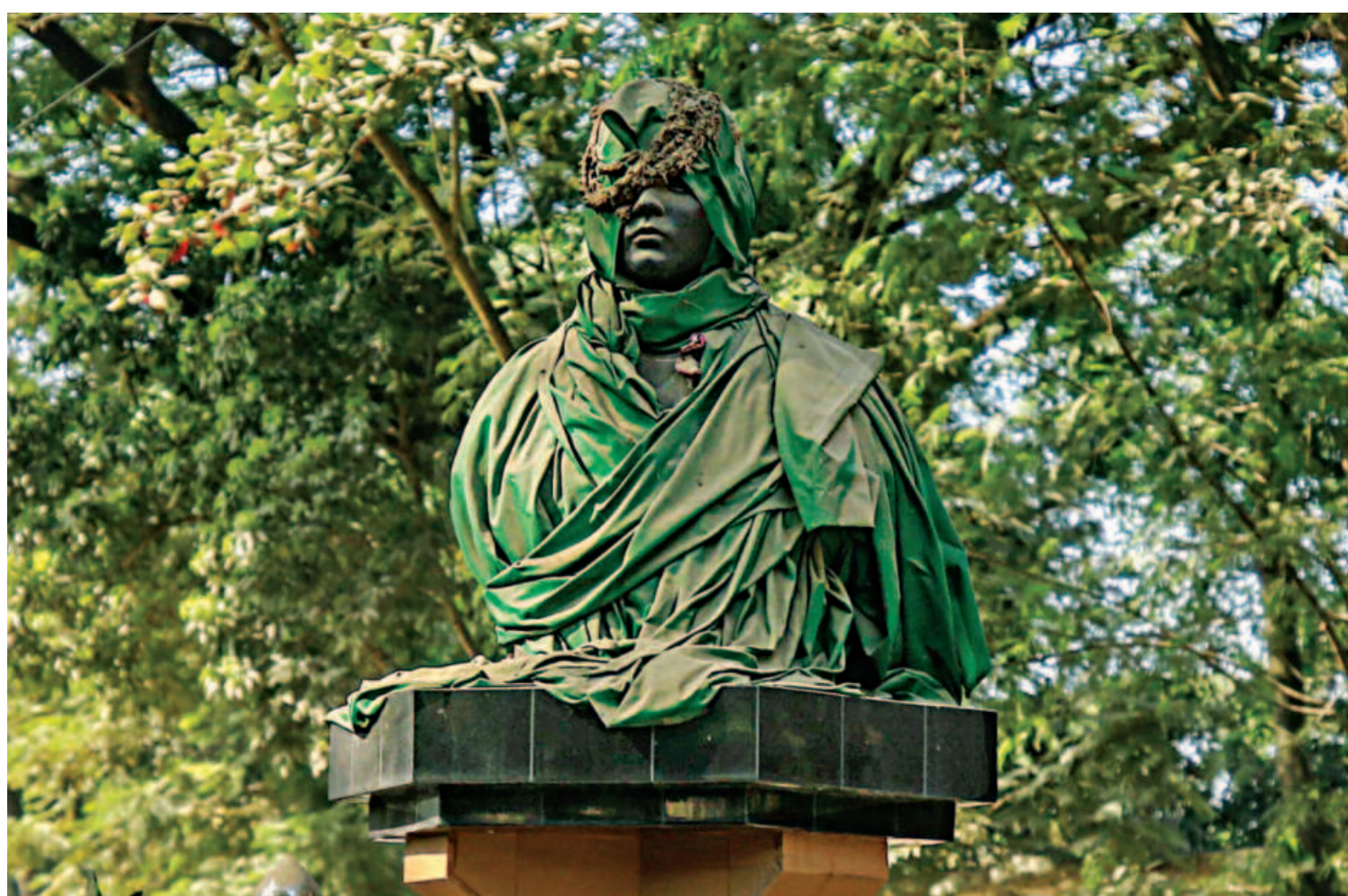
A sculpture of Pritilata Waddedhar, a prominent revolutionary figure in the anti-colonial movement, in Chattogram's Pahartoli is covered in dust, due to negligence of the authorities concerned. A piece of cloth wrapped around the bust was hardly useful. The photo was taken on Wednesday.